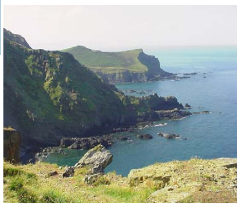
Looking across Cotton Beach to Higher Sharpnose Point in the distance. The coastline here at Vicarage Cliff, where the cliffs rise up to 450ft high, is stunning.