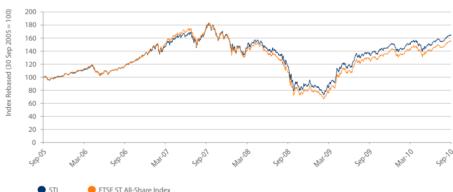
SOURCE: FTSE Group, data as at 30 September 2010