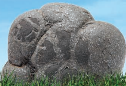
New England Granite