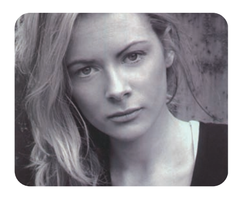
The Calling (Actor) Sun 21 June: 21.15 CINEWORLD Mon 22 June: 19.30 FILMHOUSE 2

Emily also writes and performs comedy in a zany double act called The Timecats . They will be performing at the Latitude Festival this year and the Pleasance 2010 in conjunction with Phil McIntyre Entertainment.