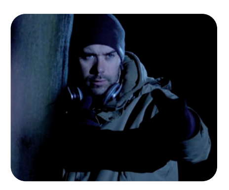
Salvage (Director) Sun 21 June: 22:15 FILMHOUSE 1