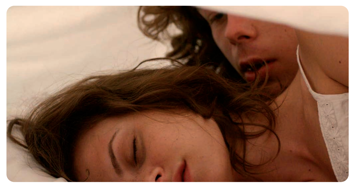
DOWN THE RABBIT HOLE