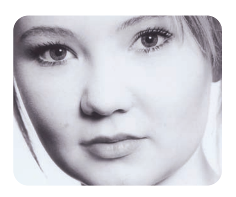
KICKS [Actor] Sat 20 June: 21:30 CINEWORLD Fri 26 June: 20:15 FILMHOUSE 2