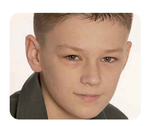
A Boy Called Dad (Actor) Thu 18 June 20:15 CINE

Thu 18 June: 20:15 CINEWORLD Sat 20 June: 18:30 CINEWORLD