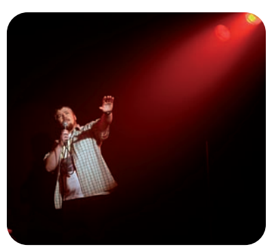
CRYING WITH LAUGHTER