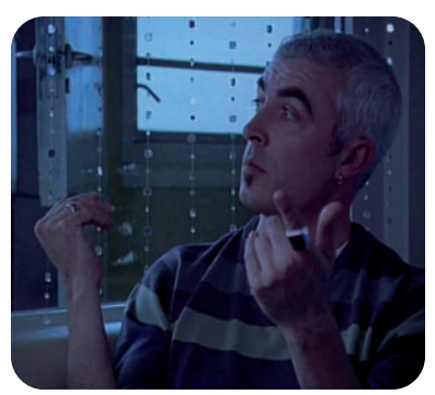
CAPTURING SPACE SWEET MOTHER (BELOW)