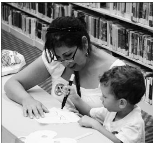
This young reader decorated a mask to wear at the Summer Reading finale.