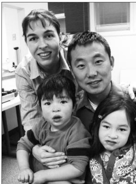
Families in Fulton came to the Callaway County Public Library to celebrate the Chinese Year of the Ox.

Capital Project Fund The Columbia Library District's Capital Project Fund, used to account for financial resources for the acquisition of property, improvements, and new additions to the Columbia Library District building, was closed.