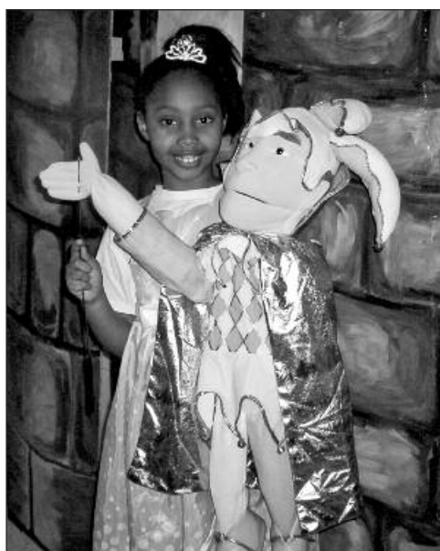
Outreach staff participate in many community events like this literacy fair at Lee Elementary School in Columbia.

Outreach DBRL expanded outreach services to seniors. Book deliveries are now being made to Bethel Ridge Estates, an apartment building for adults over 60, and to the Golden Seniors afternoon group that meets at Columbia's Armory Sports Center two to three times per week for exercise, crafts and relaxation.