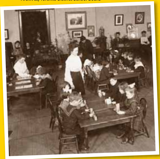
Students teachers practice teaching Kindergarten at the Toronto Normal School.