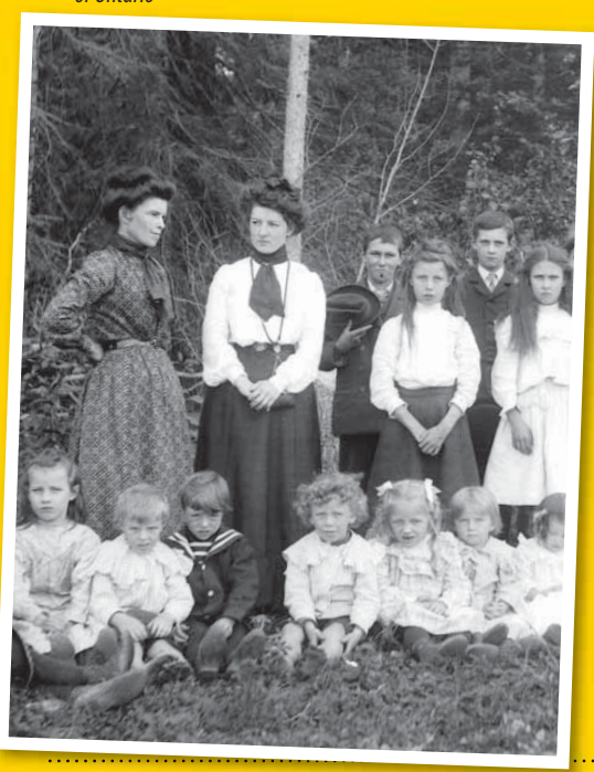
Teachers and students at a rural school, 1905.