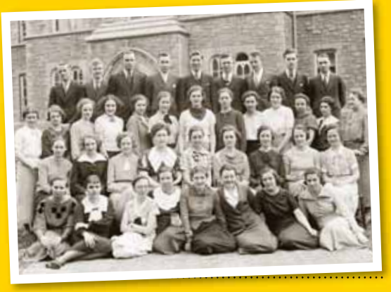
Ottawa Normal School class photograph, ca. 1925

In my opinion he will now make a passable teacher and for power, capability and aptitude to teach, as evinced in the Model School, I would award Sixty per cent.