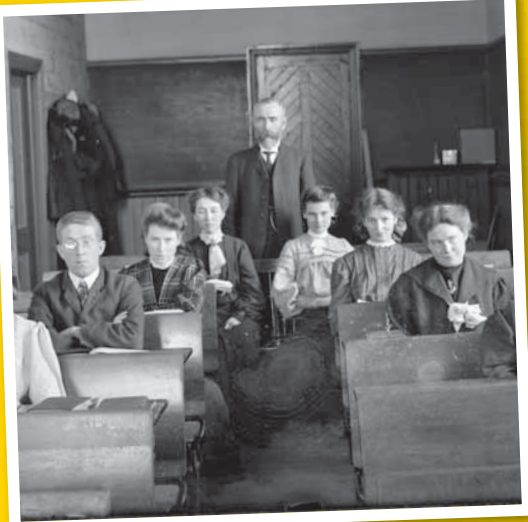
A class of student teachers in a county model school (providing basic teacher training) possibly in Gananoque, 1905.