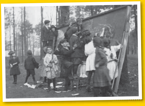
Schoolchildren crowding the blackboard at recess, ca.1917 Archives of Ontario

Next installment: In the three decades following the war, women teachers pushed for the rights of married women teachers, and equal pay and opportunity in the workplace. The baby boom brought challenges and new prospects. Federations expanded professional development programs, built bargaining departments, fought for bargaining rights, and in the 1970s proposed creative solutions to declining enrolment.