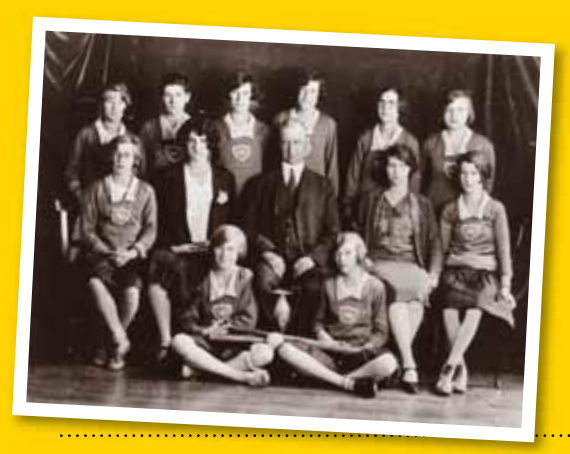
The Winchester PS girls' basketball team, 1927.