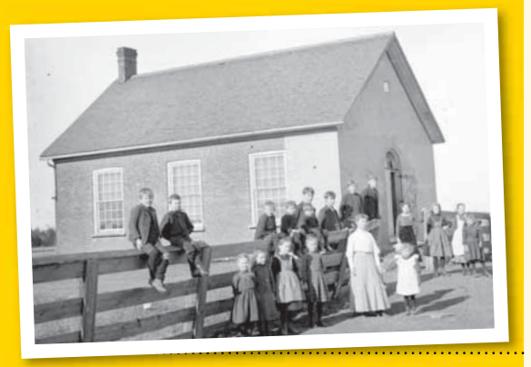
Schoolhouse, 1906.