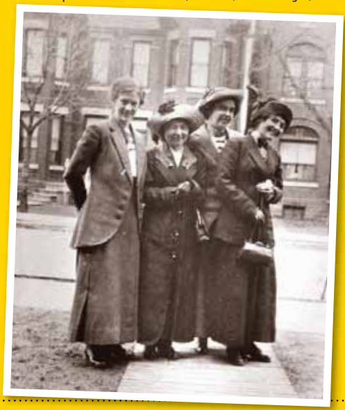
Teachers at Church St. PS, Toronto.