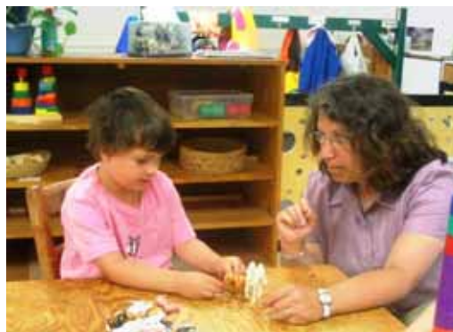
Grouping and classifying objects is one of the experiences that helps a Preschooler build competence in math

The Children’s Place provides early childhood care and education to children 0-5 years old. Currently, 58 children are cared for each day.