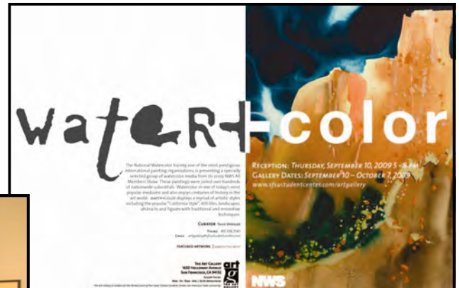
Above: the poster announcing the exhibit at San Francisco State University

http://sfsustudentcenter.com/entertainment/artgallery.php