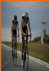
On the bikes: Photo — Tim Pyper

Western Australia's Mt Augustus is the largest rock in the world.