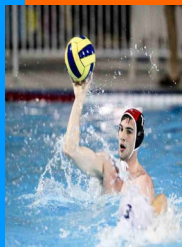
Water Sports— Photo: Victor Yong

Australia is the source of a huge percentage of the worlds opals (some sites claim 95% of opals originate in Australia)