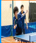
Table Tennis

Australia is the source of a huge percentage of the worlds opals (some sites claim 95% of opals originate in Australia)