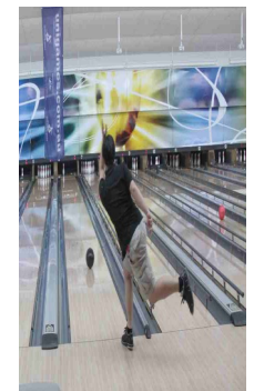
Well bowled