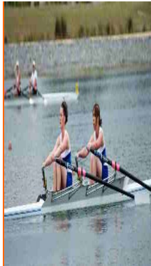
Oar-some

The Argyle Diamond mine in far north of Western Australia is the worlds largest diamond mine in the world