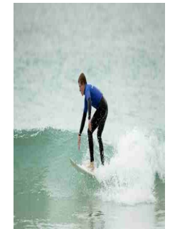
Cruisin'

In addition to the top three team medals, there was also a special 'Green and Gold' set of medals presented to the top five scoring bowlers, recognising outstanding individual performances throughout the competition.