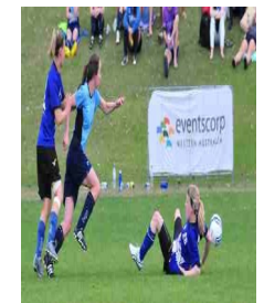
Soccer Stumble