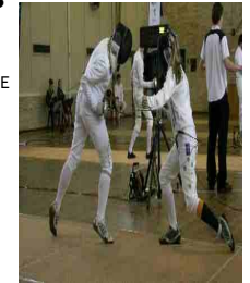
Fencing Battle