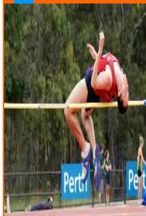
Getting high

W.A is the only place where all three types of marlin game fish can be tagged.