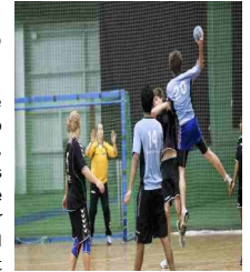
A handy game - Photo: Victor Yong

The turning point came when Monash had to replace an injured batter, and the replacement was struck out at the top of the ninth, paving the way for Sydney to clinch the gold medal with the dramatic last ditch effort.