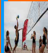
Volleyballin': Photo — Karter Lee

The worlds top selling platinum gold and silver coins can be seen at the Perth Mint.