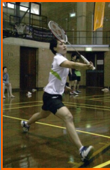
Badminton in action: Photo — Jerrod Lim

Western Australia's Mt Augustus is the largest rock in the world.