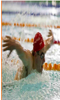
Flying through the pool

W.A is the only place where all three types of marlin game fish can be tagged.