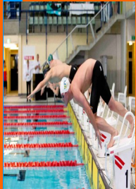
Taking a dip

Earlier in the day, the ECU women's Australian football side was narrowly beaten by Victoria University by 15- points in the final. Monash University got the bronze medal following a strong performance throughout the tournament.