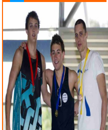
Winners are Grinners – Photo: Kee Seng Foo

The Argyle Diamond mine in far north of Western Australia is the worlds largest diamond mine in the world