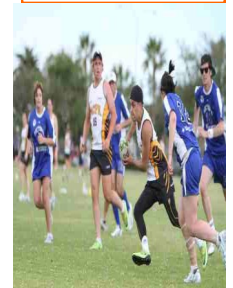
Catch me if you can

Perth is closer to Singapore and Jakarta than it is to Australia's capital city— Canberra