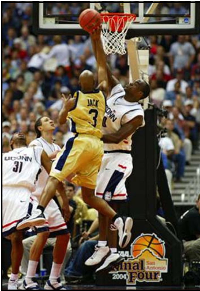
Connecticut's Emeka Okafor blocks the shot of Georgia Tech's Jarrett Jack in the 2004 Final Four. Okafor had led the nation in blocked shots the previous season and was one of the reasons the Huskies led all Division I teams in the average number of blocked shots per game from 2002 to 2009.