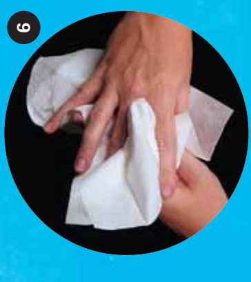
Work towel between fingers