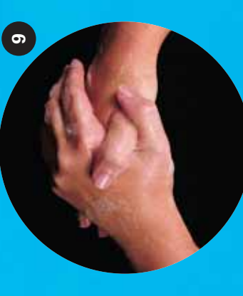
thumbs locked Rub rotationally with