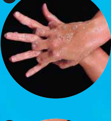
left palm over back of right hand right palm over back of left hand, Massage between fingers,