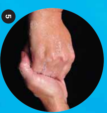
including finger tips Scrub with fingers locked