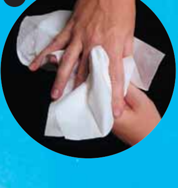
Dry around and under nails