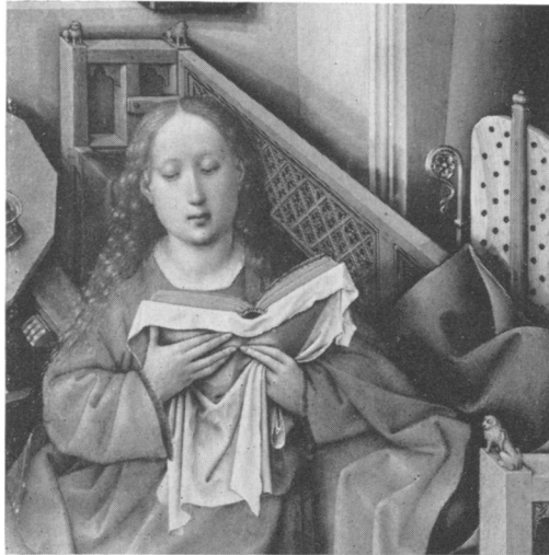
The Virgin Mary seated on the floor in the attitude of humility. Behind her is a bench with carved dogs and lions. Detail from the Merode altarpiece

Mary herself was a good housekeeper. The