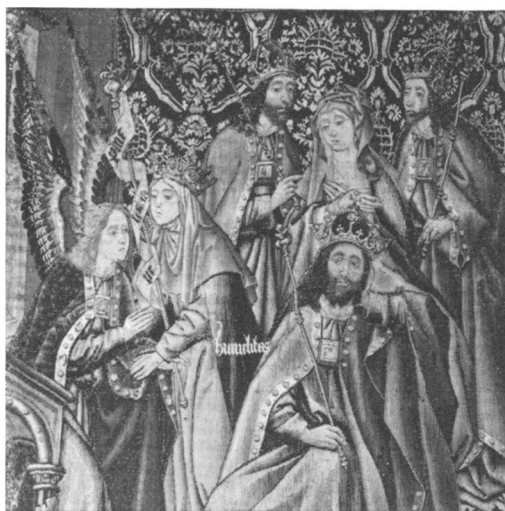
The Annunciation, detail from the Nativity tapestry at The Cloisters. Here Gabriel gives his message to Humilitas. Flemish (Brussels), about 1500

In a Brussels tapestry at The Cloisters, the Angel Gabriel pronounces the glad tidings of the Annunciation to a figure personifying Humility, rather than to the Virgin Mary herself. In the same tapestry Humility and Chastity are present at the Nativity—and, interestingly enough, it is Humility who wears a crown. The painter of our altarpiece has expressed the same idea in a more natural way. He has placed the Virgin Mary on the floor, not so that she may reach her texts more easily or because she, being young, enjoys sitting on the floor, but because