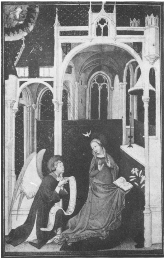
The Annunciation, miniature from the Boucicault Hours. French XV century artists usually showed the scene in an oratory. Here the candle on the altar is lit. About 1410. Jacquemart-André Museum, Paris

and close oweth to be the only desire of God.”