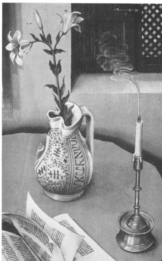
ABOVE: Details from the Merode altarpiece showing the highly polished bronze laver and candlestick, symbols of the Virgin Mary. BELOW: Bronze laver at The Cloisters, Flemish, xv century, and candlestick in the Museum collection, Flemish or German, xv century, which are similar in type to those in the altarpiece

In any case there is no doubt that other household objects introduced into the setting in a completely natural and disarming way are full of symbolism. The stalk of Madonna lilies, one of the most important accessories of Annunciation scenes from the fourteenth century on, is here rather casually arranged in a blue and white jug placed on the table as it would be in any home. The lily, of course, is first of all the symbol of Mary's purity. Saint Bernard writes: "Mary is the violet of humility, the lily of chastity, the rose of charity,