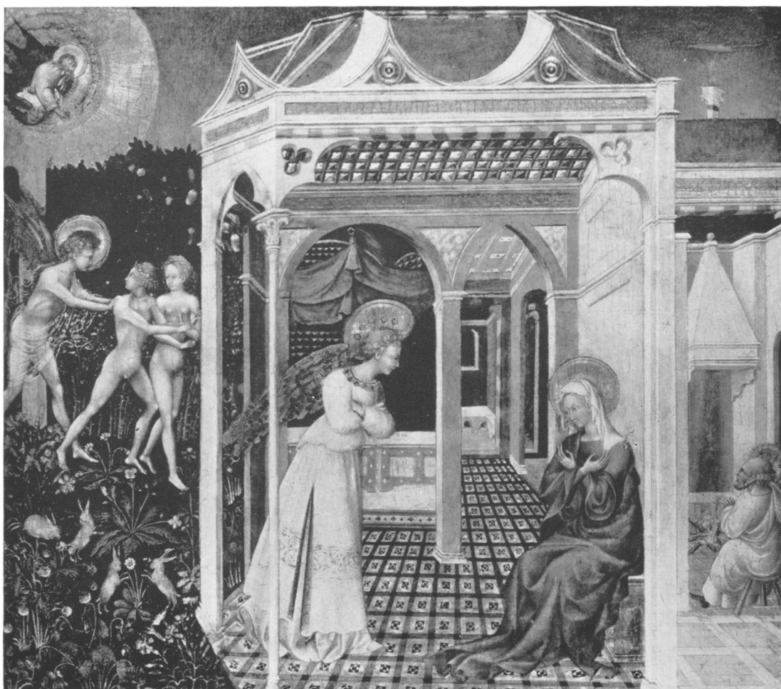
The Annunciation, by Giovanni di Paolo (died about 1482). Italian painters of the XV century generally depicted the event as taking place in a loggia. The Expulsion of Adam and Eve from Paradise emphasizes the need for a Redeemer. This is apparently the only XV century painting besides the Merode altarpiece that shows Saint Joseph in an Annunciation scene.

mousetraps. One is on display at the open window and another, of a different design, rests completed on his workbench along with sundry tools of his trade. These mousetraps, as Meyer Schapiro has brilliantly demonstrated, are placed in the picture not solely because Campin enjoyed painting such contraptions but because he intended to convey, once again, a theological concept under the guise of familiar, everyday things. The interpretation is to be found in sermons by Saint Augustine, and following him, by Peter Lombard. It was firmly believed by the people of the late Middle Ages that the knowl-