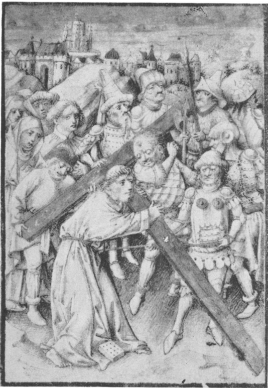
Christ Carrying the Cross, miniature from a Netherlandish Book of Hours dating from about 1470. The spike-block is illustrated here dragging on the ground between Christ's feet.

secret from the devil," says Pseudo-Bonaventura. The human flesh of Christ was the bait in the mousetrap which finally caught the devil. As Saint Augustine writes: "The devil exulted when Christ died, but by this very death of Christ the devil is vanquished, as if he had swallowed the bait in the mousetrap. He rejoiced in Christ's death like a bailiff of death. What he rejoiced in was then his own undoing. The cross of the Lord was the devil's mousetrap; the bait by which he was caught was the Lord's death."