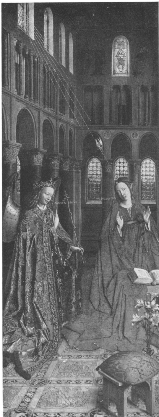
The Annunciation in a church, an early painting by Jan van Eyck (died 1441) contemporary with Campin's Annunciation, which is set in a town-house interior. National Gallery of Art, Washington, Mellon collection

in on the beams of light. This rather literal way of expressing the mystery of the Incarnation was frowned upon by the Church but had been popular in Italy and depicted elsewhere for over a century preceding our painting. The fact that the little Child carries a cross emphasizes the significance of the Annunciation: that God became Man to suffer and die in order to redeem mankind from the original sin of Adam.