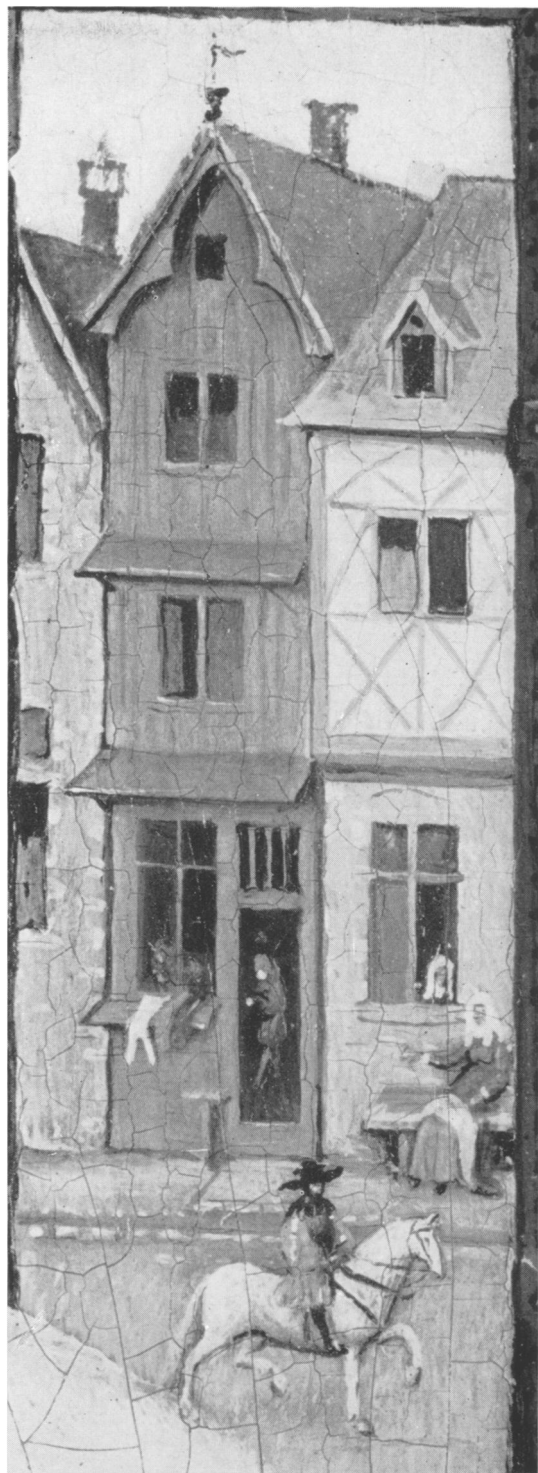
Detail of the left wing showing a street scene with shop fronts, seen through the open gate behind the donors

Of course this light which is entering Mary's chamber is more than ordinary sunlight; it is the light divine emanating from God. In many Annunciation scenes God himself is shown dispatching the dove, symbol of the Holy Ghost, on beams of light to the presence of Mary. It is undoubtedly significant that in our painting the beams of light number exactly seven. Interpreted as the seven gifts of the Holy Spirit, the beams of light become a substitute for the dove, the more familiar symbol of the Holy Ghost. Although God the Father is absent from our Annunciation and the Holy Ghost is suggested only by the seven rays of light, God the Son is very much in evidence as a tiny infant, gliding