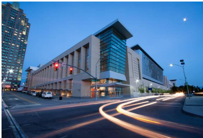
Downtown Raleigh at dusk.

The Triangle, however, has grown not as a metropolitan center surrounded by rings of suburbs but rather as a constellation of cities and towns expanding inwardly with in-fill development and outwardly with sprawl. The result is that the Triangle as a single place is a fiction of sorts. It has no single geographic or cultural center but is rather a collection of small towns, suburbs, and mid-sized cities. It is home to the state capital, to Fortune 500 companies, and to family farms. Residents tend to identify as citizens of their specific town, city or county. The atomized nature of the Triangle can make media coverage of civic issues a challenge, as broadcast and print outlets that set out to serve the regional market find it difficult to engage a majority of readers on items of local concern. A Durham city budget debate or Orange County school board election is of little interest to readers in Raleigh or