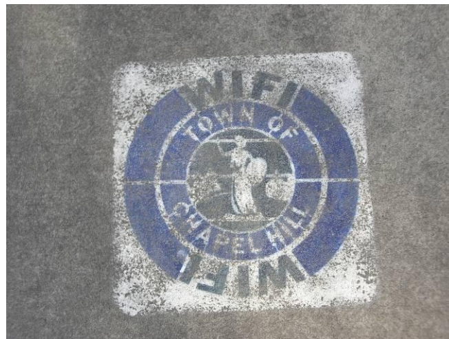
Town of Chapel Hill Wi-Fi insignia on a Chapel Hill sidewalk.

Even prior to the Google pilot announcement, towns and cities across the Triangle had implemented public Wi-Fi access, with varying degrees of coverage. 336 Carrboro's tocwireless.net was among the first in the area. Chapel Hill has been operating a wireless pilot project downtown for many years; it includes a hotspot at the Hargraves Center in the historically African American Northside neighborhood. In Raleigh, the Washington-based One Economy recently launched a free Wi-Fi project in Raleigh's Chavis Heights and Heritage Park public housing communities. AT&T and the Raleigh Housing Authority funded the $159,000 installation costs. AmeriCorps volunteers will provide four one-hour training courses to residents to teach them how to use the Internet. 337