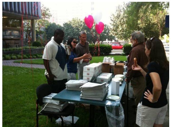
The News & Observer provides free newspapers and free Krispy Kreme donuts to promote the relaunch of its Triangle.com site, June 4, 2010.

Barkin shared Omniture data about The N&O's online traffic for this report. It shows that N&O sites received more than 161 million page views in 2009, up from 154 million the year before, with 17% of traffic going to the home page. Unique visitors rose from 18.8 million in 2008 to 23.6 million in 2009. Approximately 39% of visitors come from the Raleigh-Durham DMA. Obituaries, employment classifieds, and sports were the most popular pages. Obit pages garnered more than 9 million views in 2009. Databases with the salaries of state government employees and UNC system employees also draw heavy traffic. 131 Barkin said that, in the aggregate, photo galleries are the biggest traffic draws, particularly