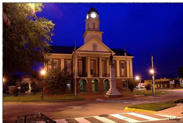
The Chatham County Courthouse in Pittsboro, which burned nearly to the ground in 2010.

In Raleigh, the most active institutions are the Citizen Advisory Councils , or CACs, which host monthly public meetings. There are 18 CACs across the city, and each is made up of a number of distinct neighborhoods. Among the most active online is East CAC , an area in East Raleigh that is home to about 10,000 residents. East CAC