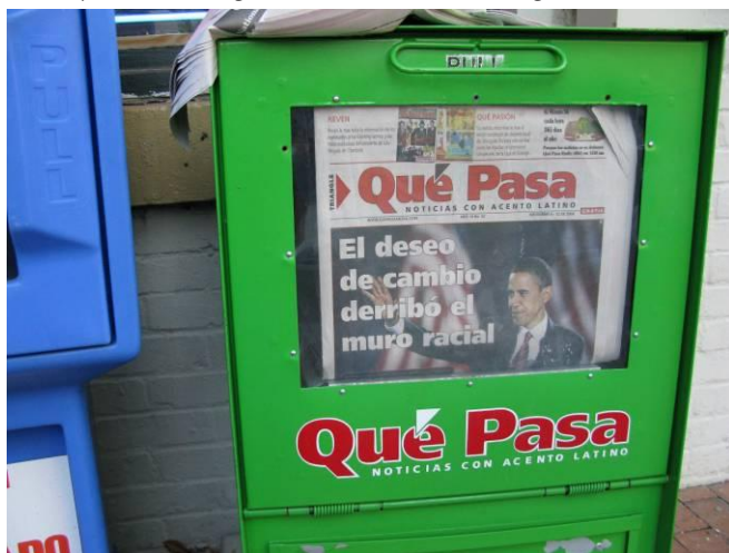
The November 6, 2008, issue of Qué Pasa , one of two weekly Spanish-language newspapers that serve the Triangle.

Spanish-language newspapers have a fast-growing audience in the Triangle. Qué Pasa promotes itself as “North Carolina's Oldest and Most Widely Read Spanish Language Newspaper,” with editions in Raleigh-Durham, Charlotte, and Greensboro/Winston-Salem. 113 The Qué Pasa Media Network also owns a set of radio stations (see Radio ). The Triangle edition has an average circulation of