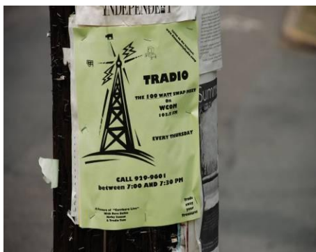
A flyer on a Carrboro utility pole advertises a show on the town's low-power FM radio station, WCOM.

WVDJ (107.9 FM) is a low-power FM station broadcasting at 100 watts from the northwest Raleigh home of its licensee, Steven White, an electrical engineer who runs the station as a hobby. The station broadcasts only music at present, and White said he broadcasts only about 50% of the time. He first applied for the LPFM license in 2001 and in 2005 purchased a house within the range of the construction permit.