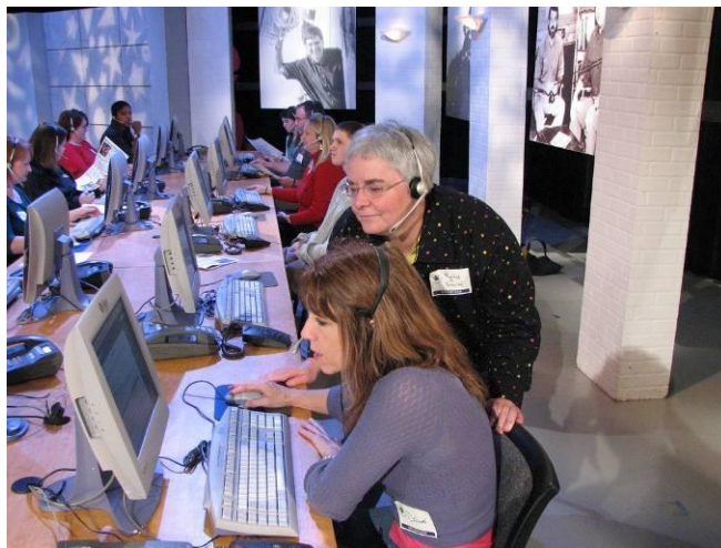
Volunteers answer pledge calls for UNC-TV's Festival 2010.

UNC-TV reaches 4 million viewers each week in all 100 counties through 12 broadcast stations located across the state. 153 Additionally, three digital channels broadcast 24 hours a day: high-def UNC-TV, UNC-KD (a children's service for preschoolers and school-age children), and UNC-EX ("the Explorer Channel"). More than one third of UNC-TV's program schedule is comprised of children's educational programming. UNC-TV has a $25.2 million budget, with $12.9 million coming from state appropriation, $7.1 million in contributions from 65,000 individual viewers, and the rest a combination of federal grants, corporate underwriting, and investment income. 154