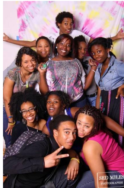
The volunteers and youth media-makers of SpiritHouse, a Durham nonprofit that produces video programs for public access channel 8.