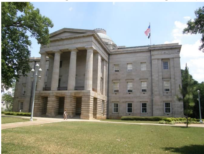
The North Carolina State Capitol in downtown Raleigh

I'd heard about the digital divide, but it wasn't until I actually experienced it that I realized how deep and wide it is. I thought the online editions were pretty cool, but when I spoke to NECD citizen and people about, 'Have you see the VOICE? Have you gone online?' I'd get these painful comments like, 'I don't have a computer,' or, 'It's busted,' or, 'I can't afford online.' It was just evident that where I was, as a Chapel Hillian, a university academic, thinking everybody's online, I was just woefully off target. And then when the print edition started and I physically,