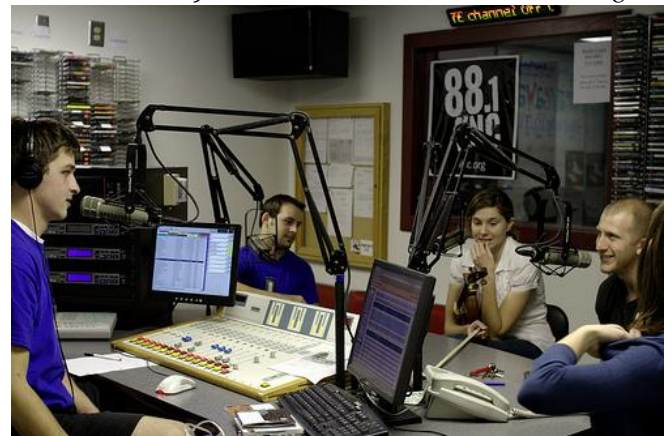
Local band Lost in the Trees during an interview at WKNC radio on the campus of North Carolina State University, April 10, 2009.

WKNC (88.1 FM) is a student-run music station at North Carolina State University in Raleigh. It broadcasts little public affairs programming, but maintains a commitment to local music, especially in recent years with live broadcasts of local bands, the daily “local lunch” program. WKNC’s web site, describes its mission thusly: “Our aim is to provide NCSU students with the knowledge needed for a career in the broadcast industry and listeners with music that doesn’t suck.” WKNC broadcasts at 25,000 watts and livestreams its signal