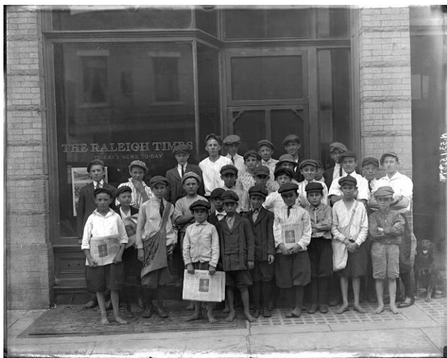
News carriers for the Raleigh Times, Aug 24, 1914. The News & Observer acquired The Raleigh Times, its chief rival, in 1955 and merged the newspapers' editorial operations. The building in the photograph was renovated and reopened in 2006 as the Raleigh Times Bar, a popular watering hole for journalists and politicians.

Josephus Daniels purchased The News & Observer in 1894. 61 In 1955, The N&O bought its rival, The Raleigh Times , and in 1989 The N&O absorbed the Times in a merger. 62 The Daniels family sold The N&O to the Sacramento-based McClatchy Company in 1995 for $373 million. 63 Prior to McClatchy's purchase of the Knight-Ridder chain in 2006, the company professed a no-layoffs policy. 64