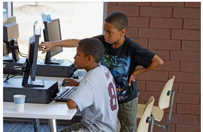
Two young residents use new computers at Durham County's South Regional Library grand opening, July 28, 2010.

But as a result of North Carolina's investment in libraries, the residents of the Triangle and the rest of the state have access to innovative programs such as NC LIVE , a