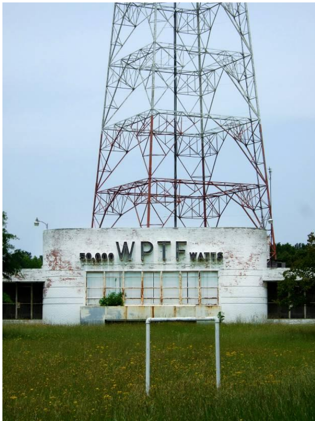
The former studio of WPTF, the Triangle's oldest continuously operating radio station.

syndicated by Premiere Radio Networks , including Rush Limbaugh and other conservative pundits. Then Clear Channel decided to convert WRDU from a country music format to a conservative talk format station with Premiere content, and WPTF lost the contract to run much of its