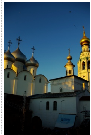
St. Sophia's Cathedral in Vologda