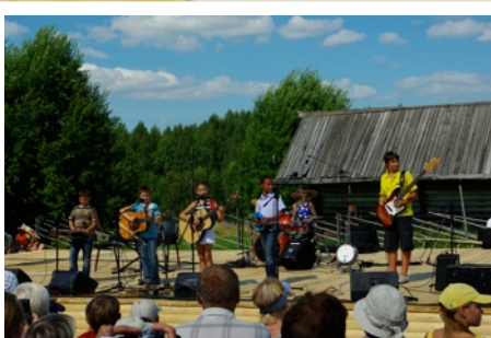
Cheerful Diligence makes everyone in Semyonkova happy.