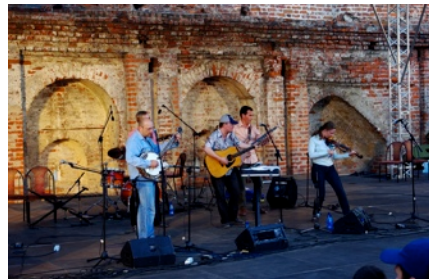
Fine Street rocks Vologda's Kremlin.