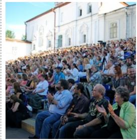
Standing room only for bluegrass fans