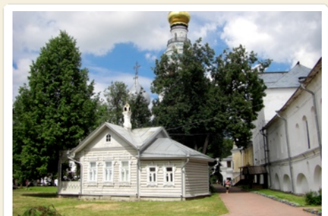
Vologda's beautiful Kremlin