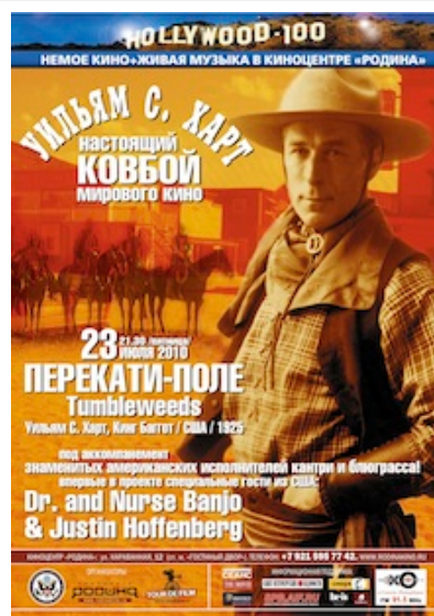
William S. Hart shows everyone why "he's the man" on the Rodina Movie Theater's posters advertising the screening of his final film, Tumbleweeds (1925).

(July 23, 2010): The U.S. Consulate General in St. Petersburg staked out virgin territory by bringing together two different U.S.-Russia Bilateral Presidential Commission projects on one stage when it combined its ongoing Silent Film + Live Music festival celebrating Hollywood's 100th anniversary with sounds from the first-ever Russian Bluegrass Festival. As a result, St. Petersburg's historic Rodina Movie Theater showed William S. Hart's 1925 masterpiece Tumbleweeds to the lonesome twang of Dr. Banjo & Friends . After watching the greatest cowboy film of the silent era, everyone understood where Clint Eastwood "borrowed" the inspiration for both his "Good Bad Man" and the "Silent Stranger" (Eastwood's cowboy says so few words he might as well be playing in a silent movie).