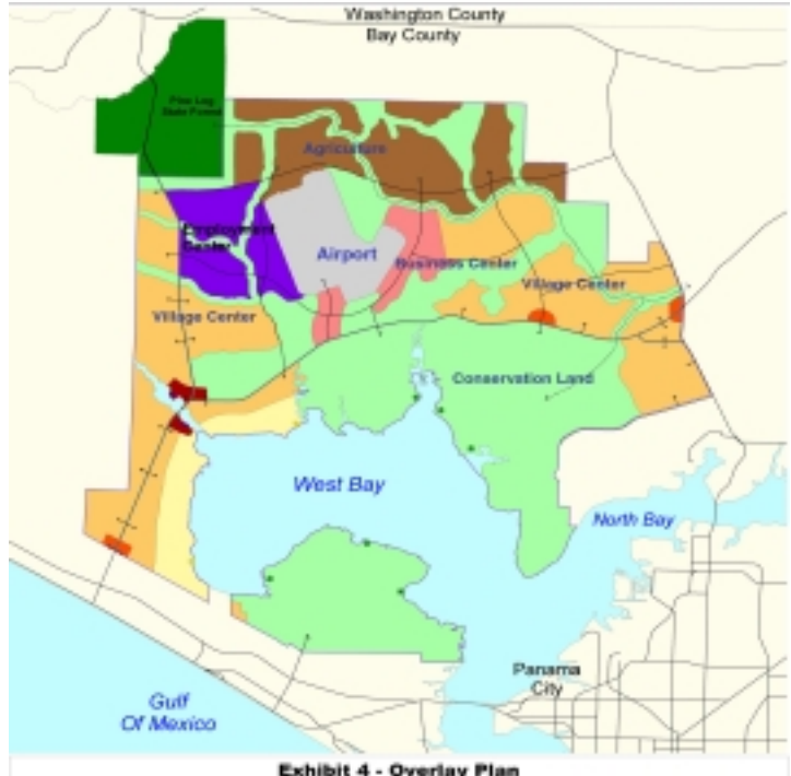
Exhibit 4 - Overlay Plan 75,000 Acre West Bay Sector Plan

The decision to send the planning documents forward was an important next step in airport relocation project which began with an initial attempt to expand the current airport runways in 1998 due to inadequate runway safety margins. Airport officials were then encouraged by the permitting agencies to look at relocation alternatives after receiving comments from opposition groups to extension plans into the St. Andrews Bay.