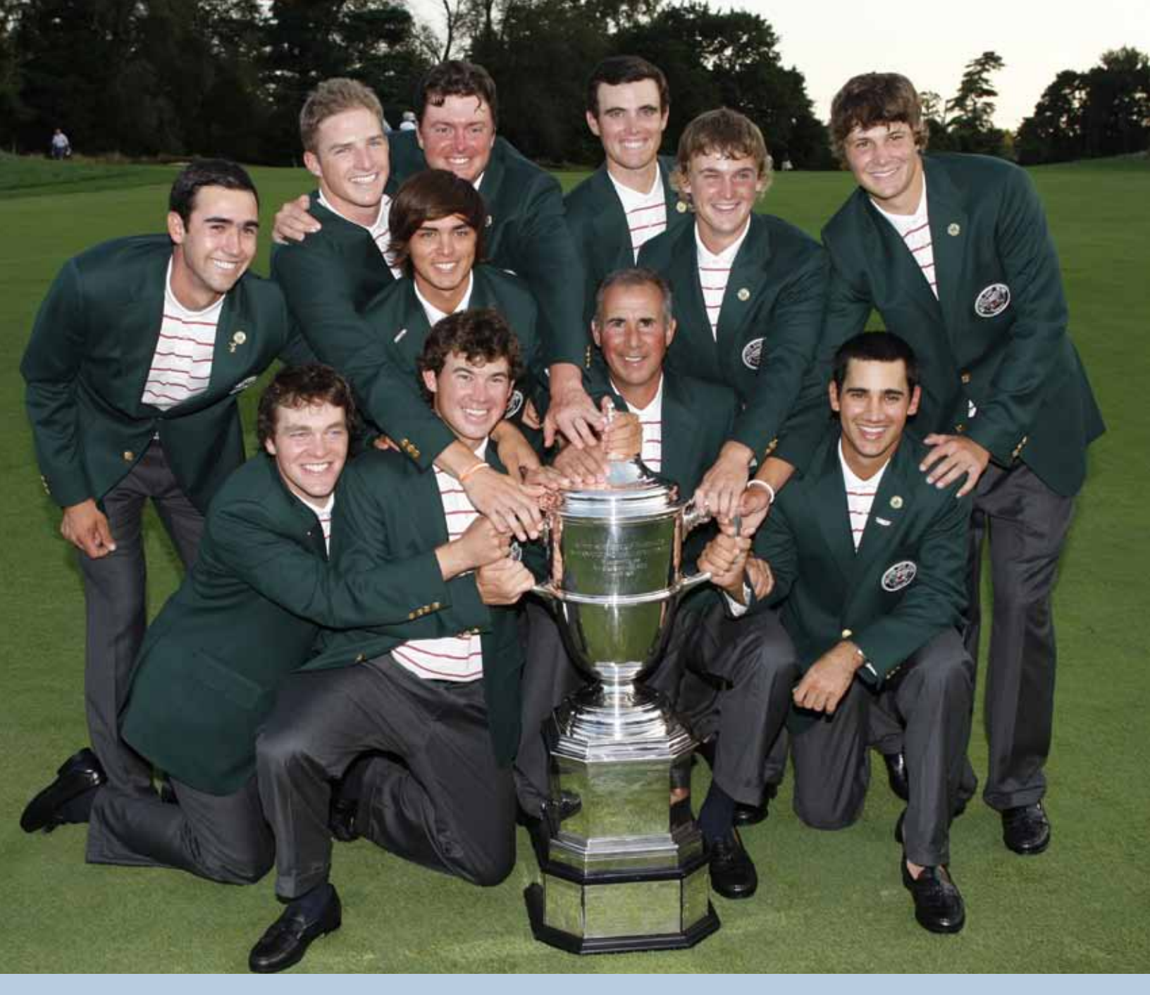
2009 Walker Cup Champion