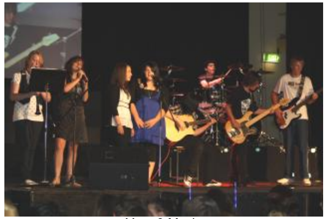
Year 9 Music