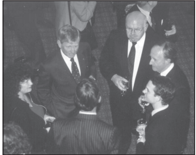
Chief Justice Gleeson joins guests for drinks in the Supreme Court Library

In an inspiring address the Chief Justice examined aspects of the foundation and growth of the Court, its work, and its influence, that are of enduring importance. His Honour emphasised that maintenance of public confidence in the Court was in large measure, dependent upon the Court basing its decisions on legal reasoning.