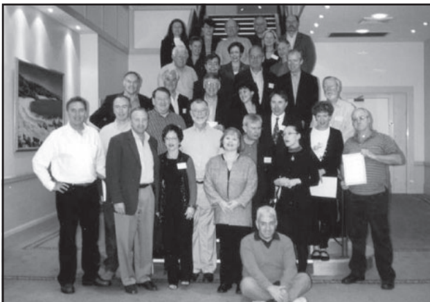
Participants & faculty members Judicial Orientation Program 2003

Last month, the AIJA, the Judicial Commission of New South Wales and the National Judicial College combined to deliver another highly successful judicial orientation program for recently appointed judges. At the request of the newly formed Judicial College, which is now responsible for national judicial education, the AIJA will continue to provide input and expertise into future judicial orientation programs to be conducted by the College.