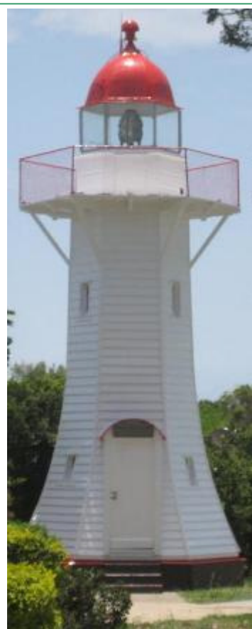
Historic Lighthouse, 29 Nov 2009 (P. Browne).

The official opening ceremony of the historic lighthouse, to mark its preservation and relocation, was held on 22 April 1972. Special guest was Sir Raphael Cilento of the Queensland Division of the National Trust. Planned attractions on the day included an historical fashion parade, children dressed in fashion of the era of the original lighthouse, a display of side saddle horseback riding, and music by the Bundaberg Municipal Band. Vintage cars were also a feature and the plan was to have Sir Raphael Cilento travel from Bundaberg to Burnett Heads in one of the vintage vehicles.