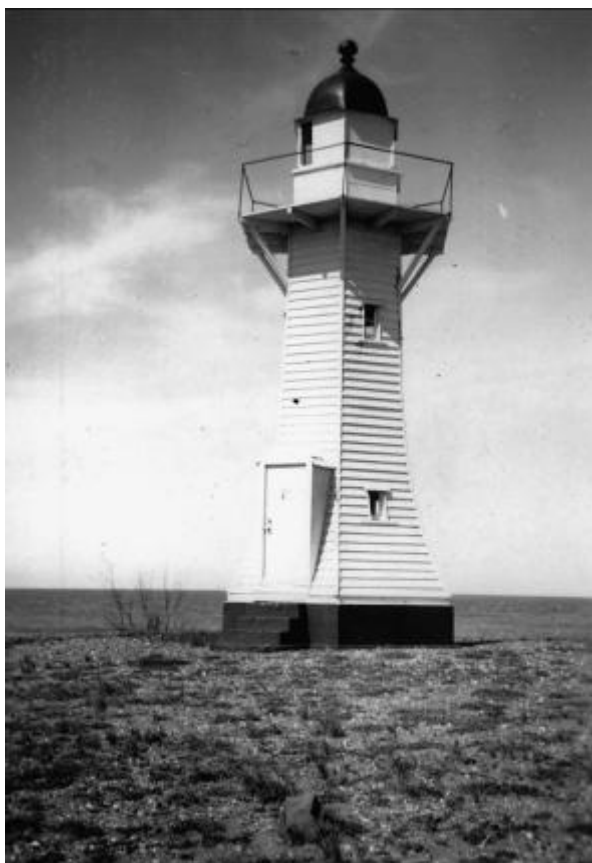
Old Lighthouse in original Burnett Heads (South Head) location, date unknown.