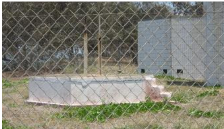
Old Lighthouse Base - next to new lighthouse.

They also inspected the old lighthouse, for which Mr Millen (Milne) brought the key. It was found to be in good condition and had new flooring and recently restored foundations. It was decided that the acetylene burner and prisms would be removed from the old lighthouse as they were not original parts, and that the Department would supply old style lights more in keeping with the period the lighthouse was originally built.