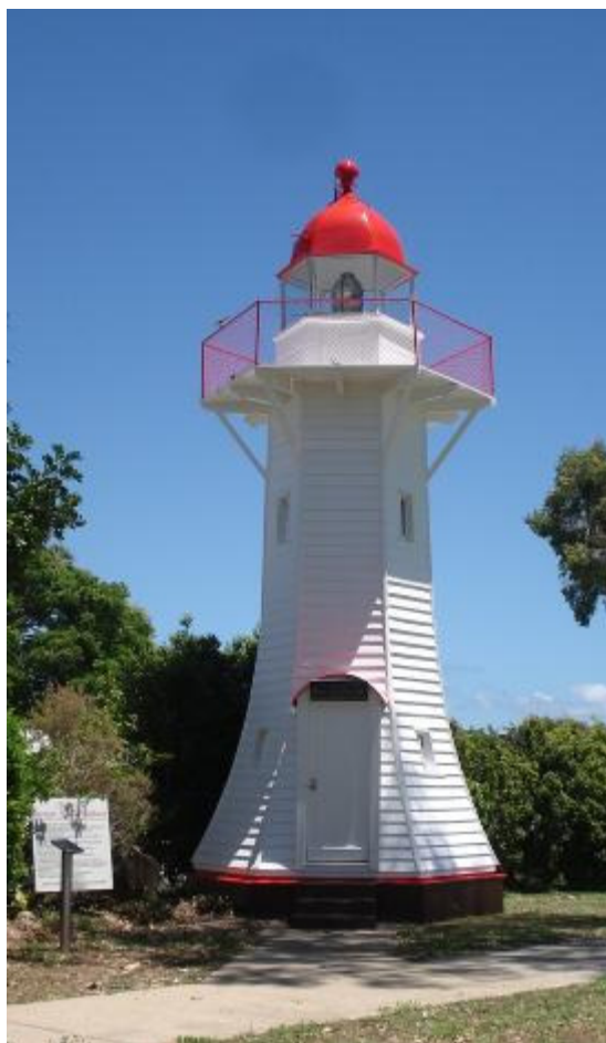
Old Lighthouse in current Burnett Heads location, Dec 2009.