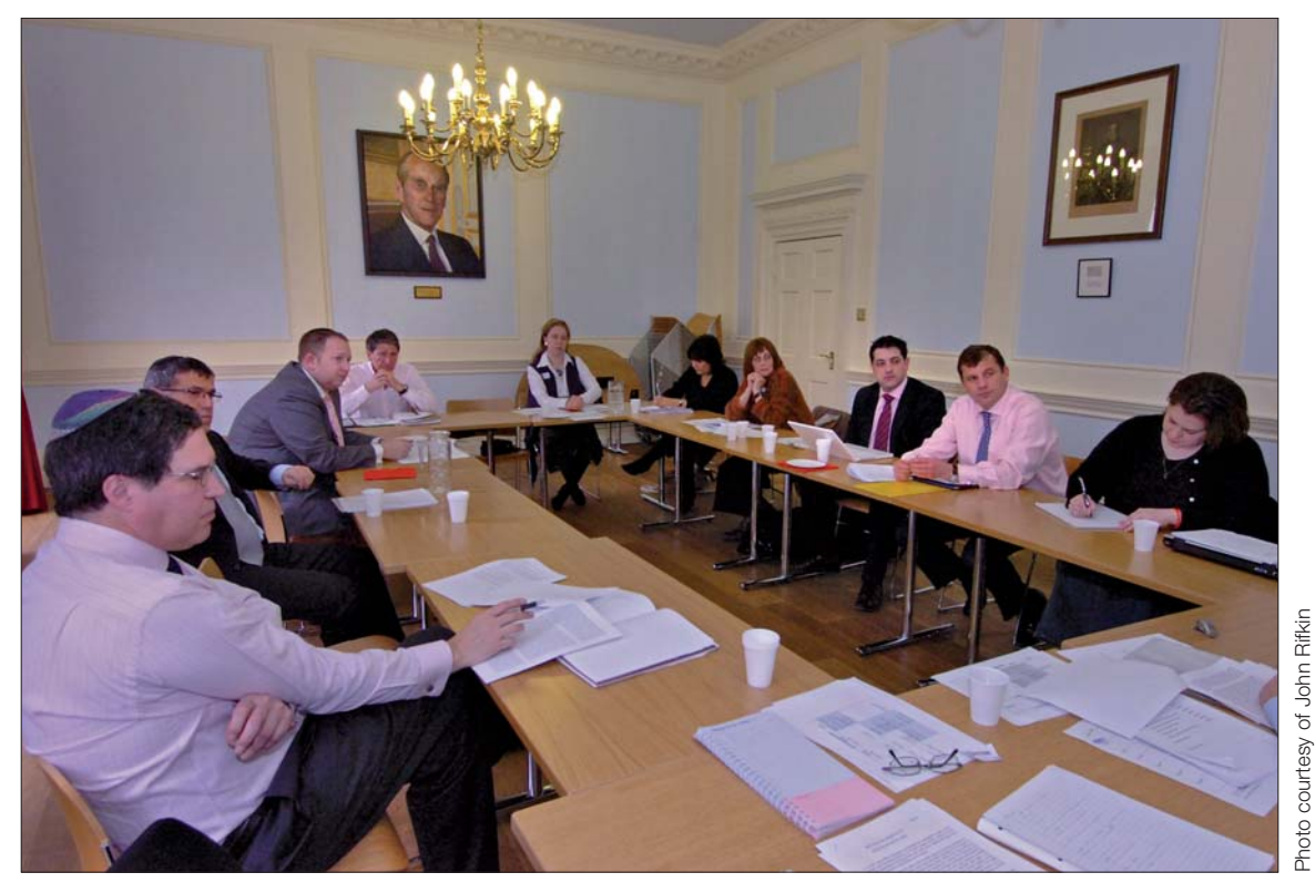
A meeting of the Commission on Jewish Schools