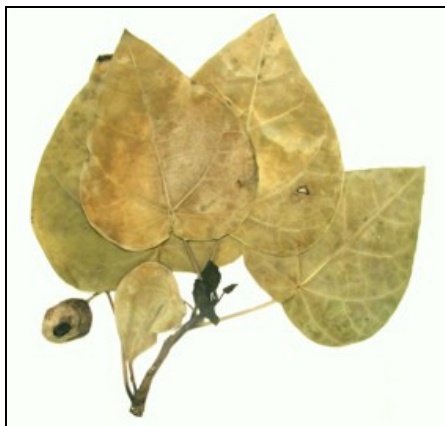
Hernandia nymphaeifolia .