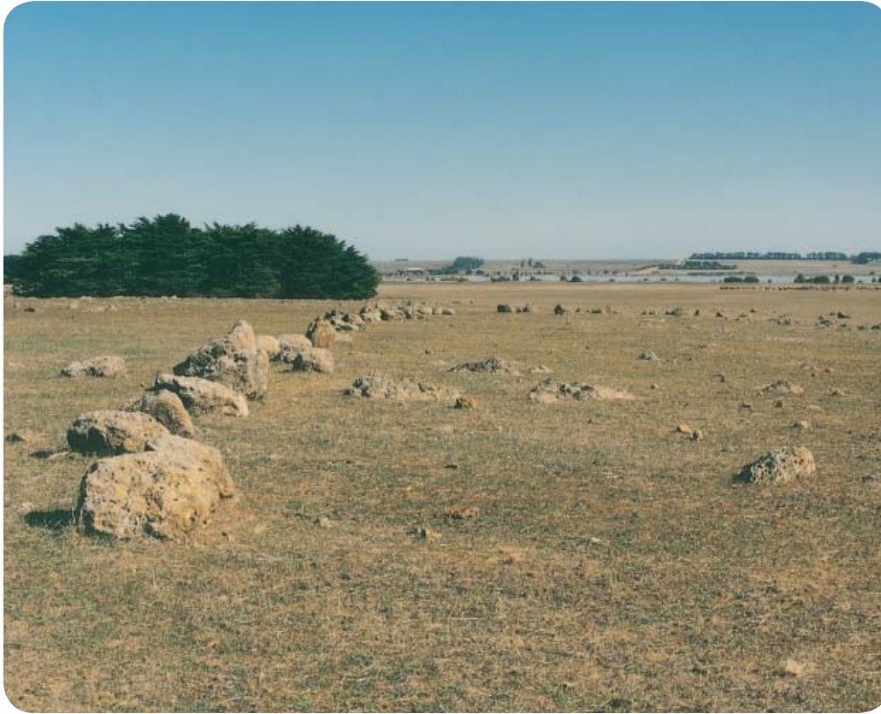
Lake bolac Stone Arrangement