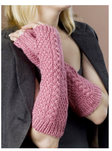
click to enlarge image schematic

Glove measures approximately 4" wide by 14" long