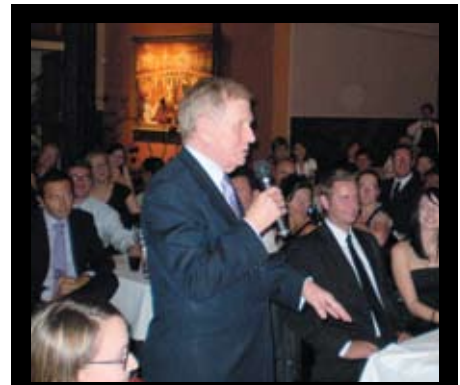
Justice Michael Kirby delivers speech to an admiring audience

With so much laughter and good feeling, it was decided by universal consensus that the Law Alumni Dinner must be an annual event. Further suggestions for future Law Alumni functions included quarterly cocktail functions where Newcastle-based Alumni could meet and mentor senior law students, and an Annual Sydney Law Dinner for the many law Alumni who are based in that metropolis or in Canberra. Look out for further details of these upcoming events in the new year, through the Alumni website alumni@newcastle.edu.au