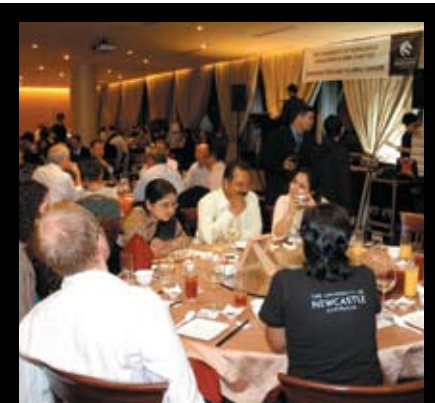
New graduates join the Alumni Chapter to celebrate

The President of the Singapore Chapter invited new graduates to join the Chapter and the Committee in planning for 2008. If you are interested, please email Singapore Alumni at Singapore-alumni@newcastle.edu.au .