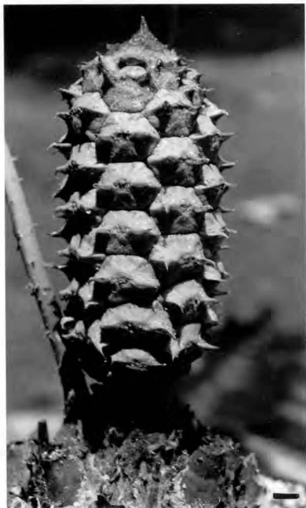
Figure 2. Mature megastrobilus, scale bar = 1 cm.

stipulate, 3–3.2 cm long, 2.6–2.8 cm wide at base. LEAVES pinnate, glabrous, 3–5, ascending, extending forming an open apical crown, 50–73 cm (mean = 60) long, 30–42 cm (mean = 38) wide ( N = 25 ); petiole and rachis terete, armed with few prickles that diminish in number and thickness from proximal to distal ends; petiole linear, 19–41 cm (mean = 25) long, 0.8 cm diameter, tomentose at base, rachis 30–64 cm (mean = 57) long; LEAFLETS coriaceous, 5–16 (mean = 15) pairs, opposite to subopposite at times subalternate along proximal and mid portion of leaf, oblanceolate, rarely bidentate at or near asymmetrical apex, apex acuminate, margin entire, subrevolute, brilliant green on adaxial surface, light green on abaxial, 6.5–21 cm (mean = 16.5) long, 3.2–6.5 cm (mean = 4) wide, veins visible 30–38 (mean = 32), intervein distance 1.1–1.6 mm (mean = 1.4) (all N = 25 ). MICROSTROBILI erect,