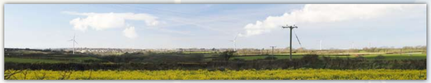
New view from road to Waterston