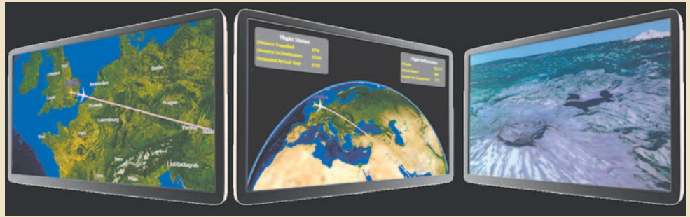
The new SkyPro moving-map display from Emtec is an example of the multiple information sources available, as well as the virtual-reality imagery that can be accessed using satellite mapping.

Rockwell Collins has only recently taken its Airshow moving-map system into what it's calling Version 2, which has new and refreshed features to take advantage of some 200 3-D enhancements. Best of all, say some who saw it introduced at EBACE, is the "dramatically realistic" result of input from some of Southern