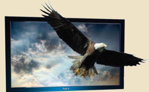
Three-dimensional imagery on the moving-map display has become commonplace.

In partnership with Heads Up Technologies of Carrollton, Texas, licensed to design and manufacturer XM satellite radio equipment for aircraft applications, Eugene, Ore.-based Rosen is also offering XM radio content.