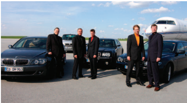
Munich's MES Handling moved up one spot in AIN 's international FBO survey between this year and last year. Last year the company occupied the fifth spot and garnered an overall rating of 7.88.