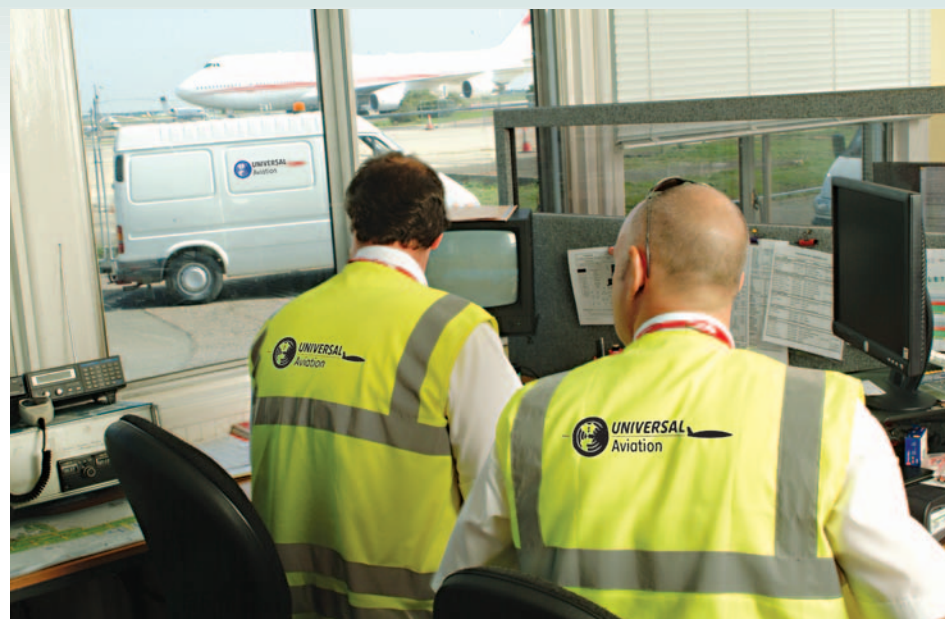
Universal Aviation's facility at London Stansted focuses on providing trip support and does almost everything but fly the airplane. The Stansted facility nearly cracked the top 10 last year, with its 7.71 rating earning it the 11th spot.

Operating business aircraft globally is getting increasingly complex due to factors