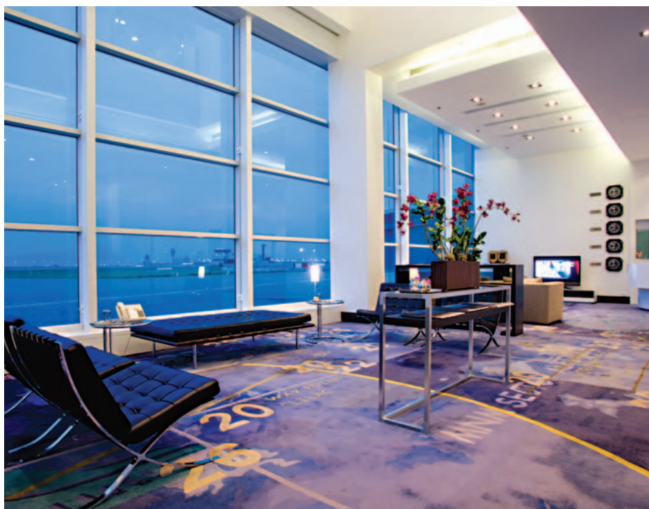
The Hong Kong Business Aviation Centre, below, expects double-digit annual traffic growth in the near future.