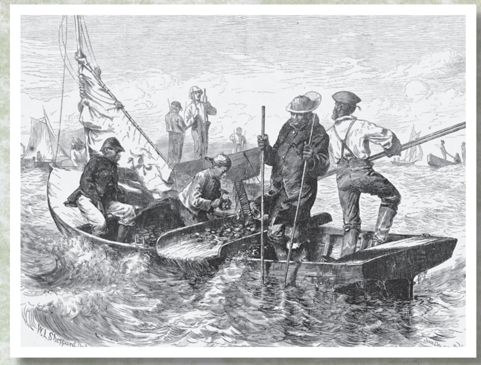
Oyster tongers circa 1880

The site commanded the rich oyster beds of Tangier Sound, and a new railroad built by the investors provided a means of quickly marketing oysters. Docks received the daily harvests and packing houses employed hundreds of people, white and black. All the support industries and coarse amusements that went along with the boom-town mentality pervaded tidewater