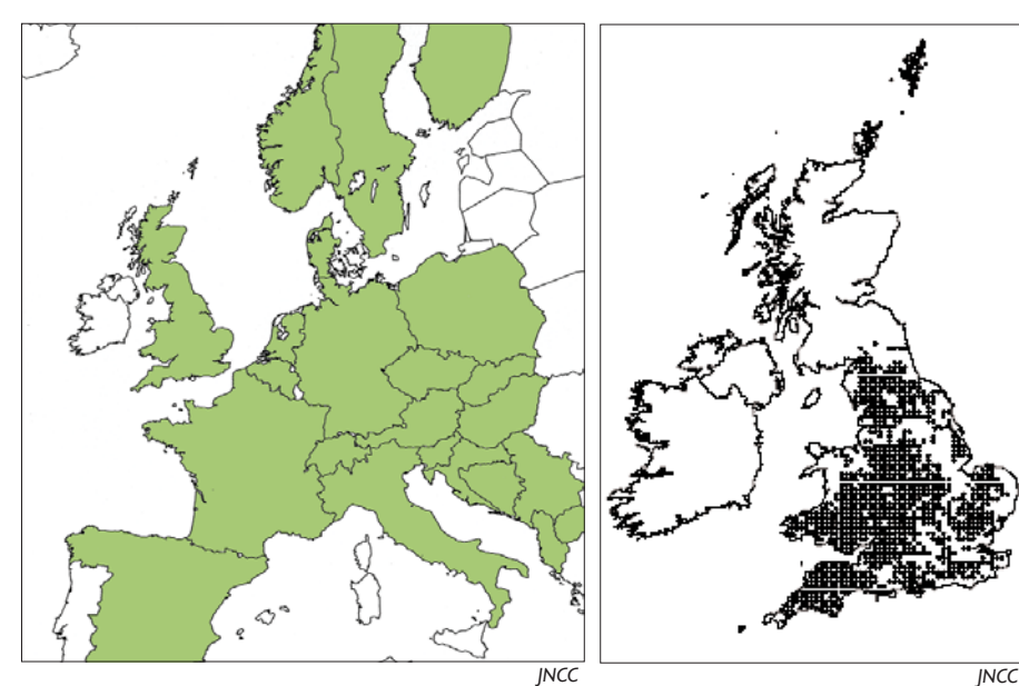
The bullhead is found throughout Europe, but not always in large numbers.

predominantly occur in stony streams and rivers where the flow is moderate and the water is cool and oxygenrich. These range