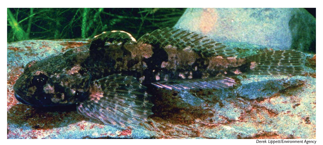
Male bullheads assume breeding colouration when seeking a mate. After excavating a nest and attracting a female by making knocking sounds, a male bullhead will defend its nest and fan its eggs with its pectoral fins.

provided by the male, fungi rapidly invade the eggs. It is thought the male fasts at this time, although he may consume some eggs to survive, especially if stressed (T Hatton-Ellis, pers. comm.).