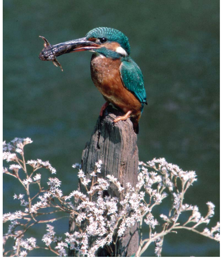
GH Higginbotham/English Nature

Bullhead are vulnerable to predation by a range of species, including piscivorous birds such as the kingfisher.