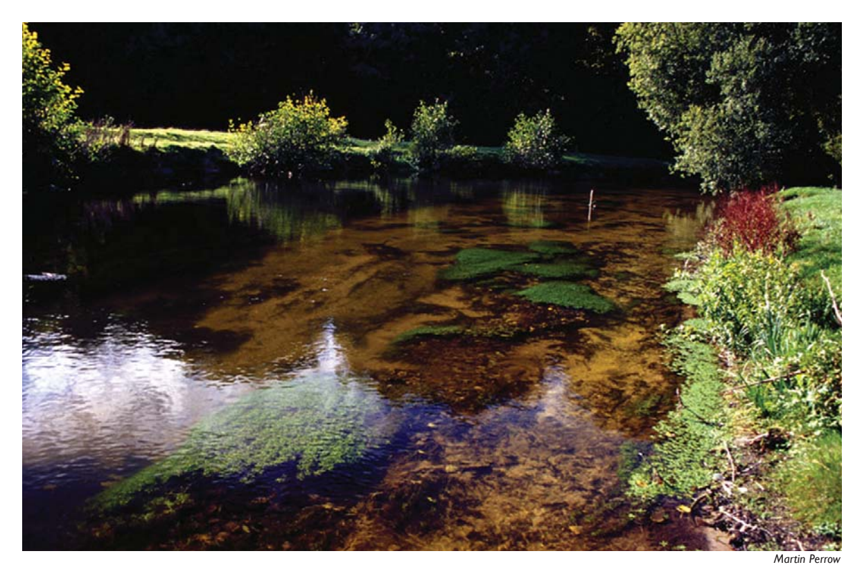
Bullheads will use macrophytes as refuges from predators and flows if large stones are unavailable.

Thus, bullhead densities have been found to be greater in streams with a substrate of stones and gravel than on sandy and silty substrates, regardless of the presence of macrophytes (Smyly 1957, Mills & Mann 1983). Indeed, some forms of macrophyte may be avoided: Gaudin & Calliere (1990) showed that