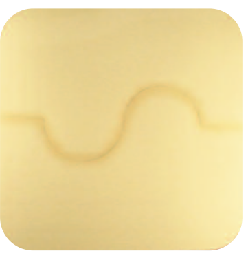
Appearance of an unaffected patch