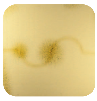
Appearance of the patch with defect visible as a snowflake pattern