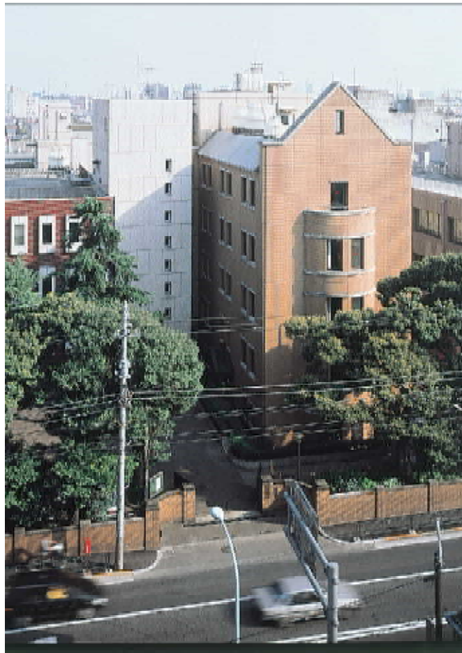
Front View of The Toyo Bunko

Set on a 3,688 sq. metre site, The Toyo Bunko's Main Building, Annex and two book stack wings have a total floor space of 7,134 sq. metres, of which 4,091 sq. metres are occupied by the Library's stacks.