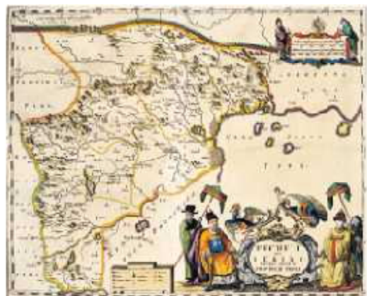
Atlas nuevo de la Extrema Asia by Martino Martini, 1659