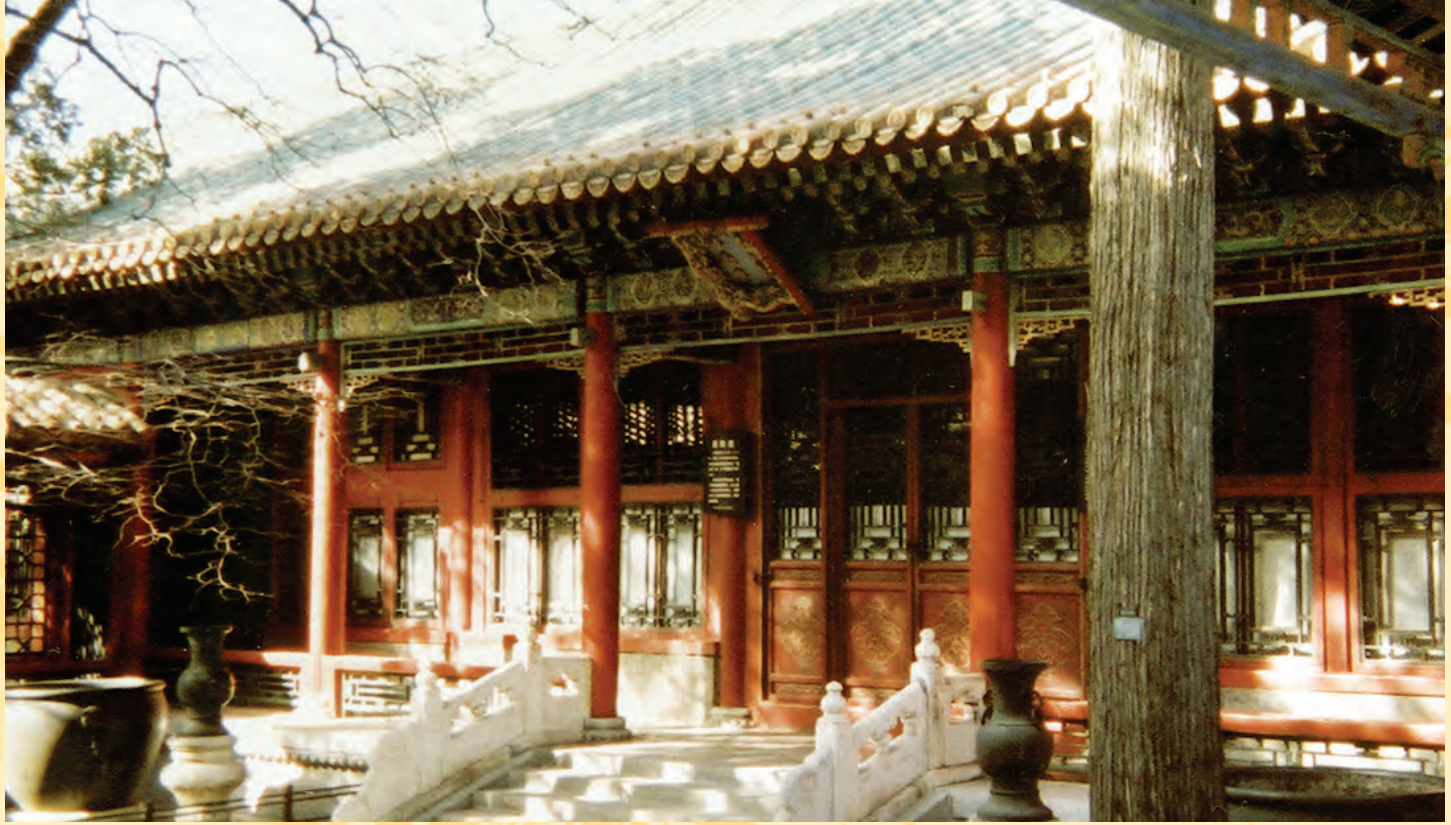
THE LODGE OF RETIREMENT