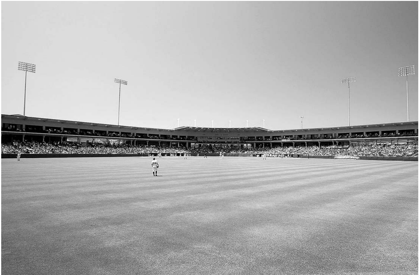
New Cut Line