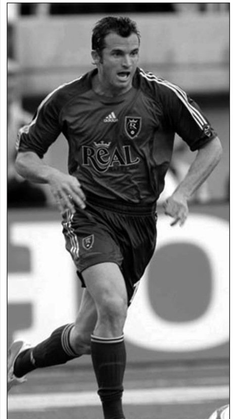
Chris Klein is in his first season with Real Salt Lake. He played eight years with Kansas City.