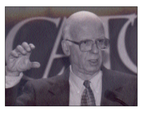
David Broder: "In this day and age, initiatives are both more sweeping in their content and more numerous than they have been for a very long time."

We are talking about a very large and money-driven process. In the 1998 election cycle I was able to verify at least $250 million spent on initiatives at the state level. That is about $100 million more than the taxpayers gave