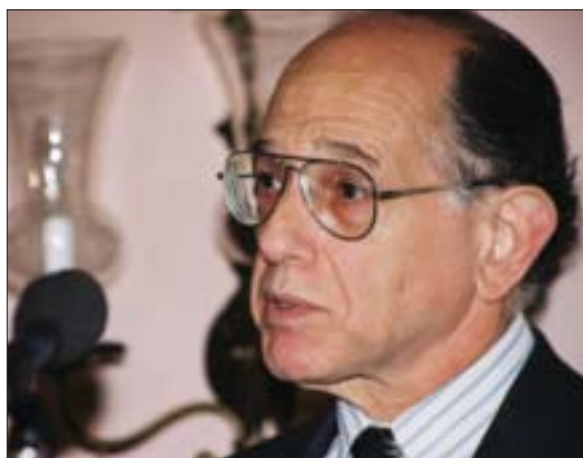
Robert Levy: "Other things being equal, the fit of a terrorist profile that includes ethnicity is likely to be tighter than the fit of a criminal profile that includes race."

There have been eight major terrorist acts against the United States and its allies