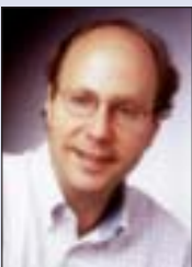
Jeffrey S. Yass

A graduate of Harvard College, he was an early employee of both Intel and Apple Computer and is on the Board of Directors of E-Trade. Yass is managing director of Susquehanna International Group, LLP, a trading firm specializing in stock options. He is profiled in The New Market Wizards: Conversations with America’s Top Traders by Jack D. Schwager and was described as one of “76 Revolutionary Minds” by Philadelphia magazine.