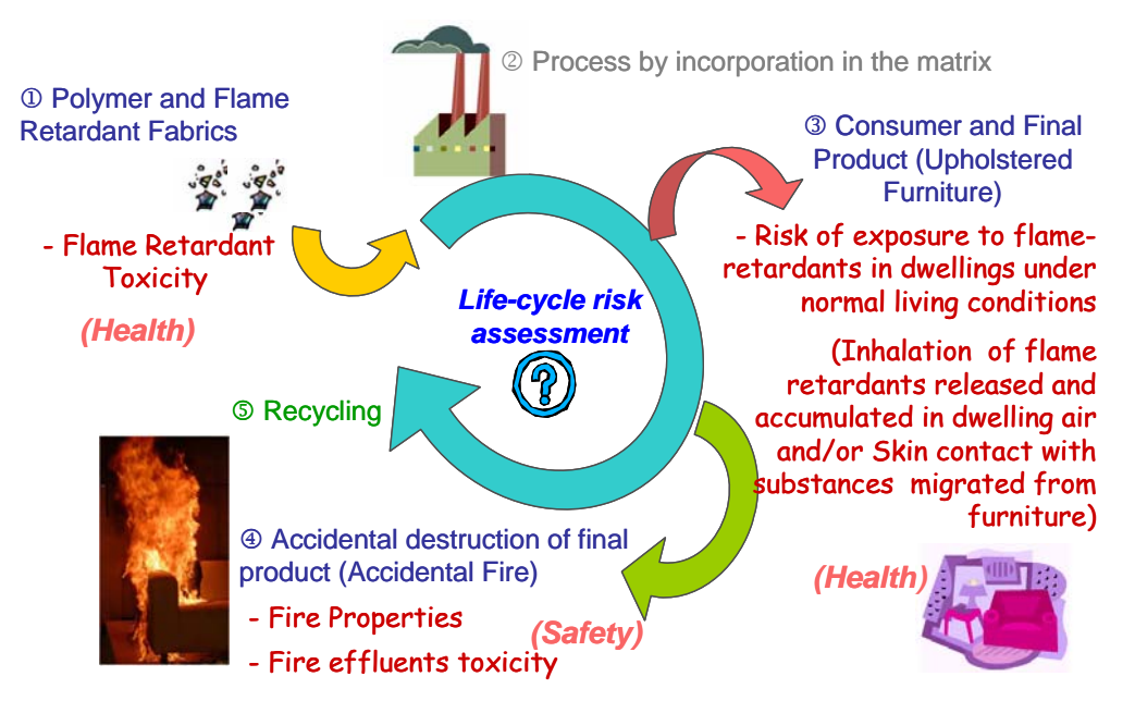
Figure 1: Impact of flame retardant used in upholstered furniture during Life-Cycle

According to the Directive 2001/95/EC of the European Parliament and of the Council, december 3rd, 2001 on General Product Safety, all producers shall place only safe products on the market [xi]. A product is defined as safe if the health and safety requirements of the product (upholstered furniture) are fulfilled. In this paper, a methodology was proposed to estimate risks and benefits of flame-retardants within the life-cycle risk assessment (Figure 1).