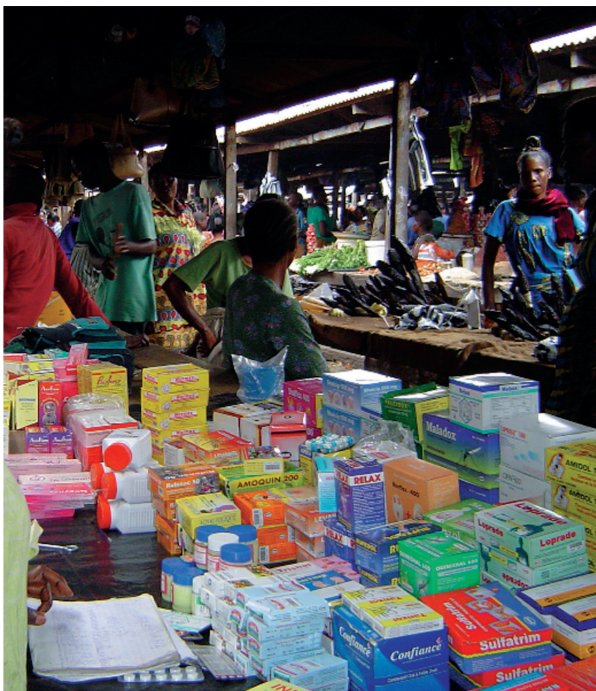
Where do these medicines come from?

By working with the World Customs Organization, INTERPOL, and informal networks of enforcement officers, the Permanent Forum on International Pharmaceutical Crime, IMPACT offers an important opportunity for improving contact and mutual understanding among enforcement officials of different countries in order to improve coordination of operations and exchange of information. IMPACT is also a tool for enforcement officers to establish communication with health authorities and other stakeholders. The enforcement working group is working also at developing training materials for enforcement officers of countries that need to improve their technical skills in the detection of suspected counterfeits