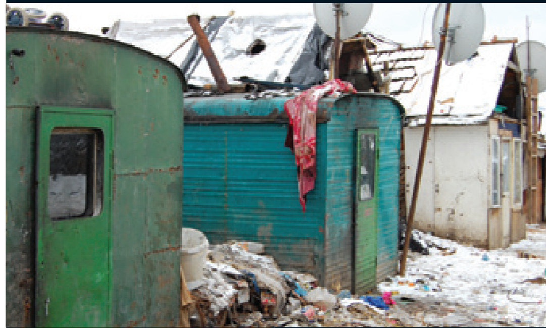
Above: The metal cabins provided as homes for Roma by the Miercurea Ciuc authorities

In April 2009 the Serbian authorities forcibly evicted 250 Roma from a temporary settlement in New Belgrade. For many of the residents, who were originally displaced from Kosovo, this was not the first time they were torn away from their homes. The authorities offered them containers to live in, in another part of the city, but local residents tried to set the containers on fire. Since then the authorities have carried out a series of evictions of Roma communities around the city.