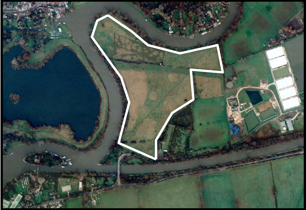
-Figure 3 PMZ22 Desborough Island