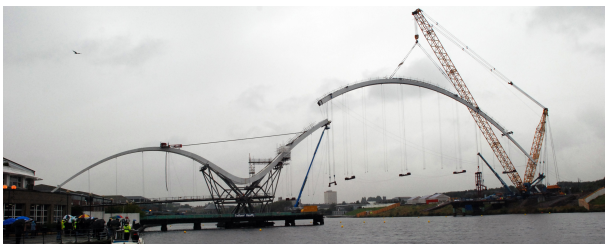
Figure 4: Lifting of Northern Arch

After the complete deck was installed the edge cables were connected, along with the balustrades, and finally the lighting scheme. The TMD were then installed and tested using accelerometers and several men running and lunging in phase and at set speeds. They were initially tested locked without the dampening effect but with the added mass, and then with the dampening effect unlocked. Only one of the dampeners required tuning.