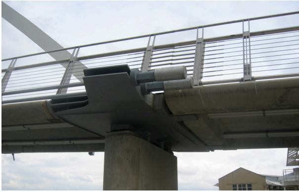
Figure 3: Reaction Frame