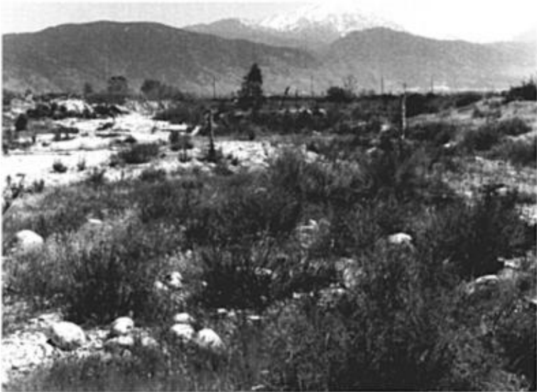
Figure 2. Riversidean alluvial-fan sage scrub along the Santa Ana River (east Highland) where a juvenile California Gnatcatcher was seen in 1995.

6. Santa Ana River, east Highland (Figure 2), where on 28 June 1995 McKernan and Marnie S. Crook saw one juvenile in Riversidean alluvial-fan sage scrub. Elevation approximately 460 m. Associated plants Salvia apiana , Eriogonium fasciculatum , Lotus scoparius , and yerba santa ( Eriodictyon trichocalyx ). Soil Soboba stony loamy sand, slopes 2–9%.