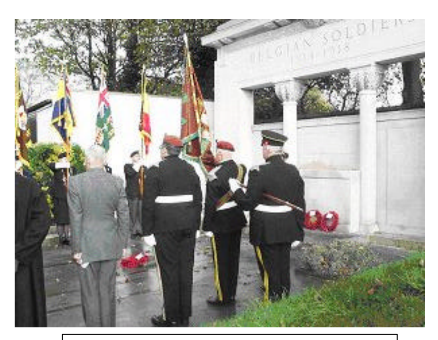
Armistice Day ceremony at the Belgian War Memorial, St. Mary's Catholic Cemetery, November 2000

In 1858 St. Mary's Catholic Cemetery was set up west of All Souls' Cemetery. Many of the 12,500 people buried there during the next eight years were Irish immigrants escaping the potato famine. Later burials included Sir Anthony Panizzi (d. 1879), the Italian-born principal librarian of the British Museum, who was partly responsible for the creation of the famous Round Reading Room, and Prince Louis Bonaparte (d. 1891), a nephew of Napoleon I. During the First World War two Belgian soldiers who had died in St. Andrew's Hospital, Dollis Hill, where buried in the cemetery. The plot eventually became a Belgian military memorial and cemetery and now also includes a number of graves from World War Two, including at least one woman.