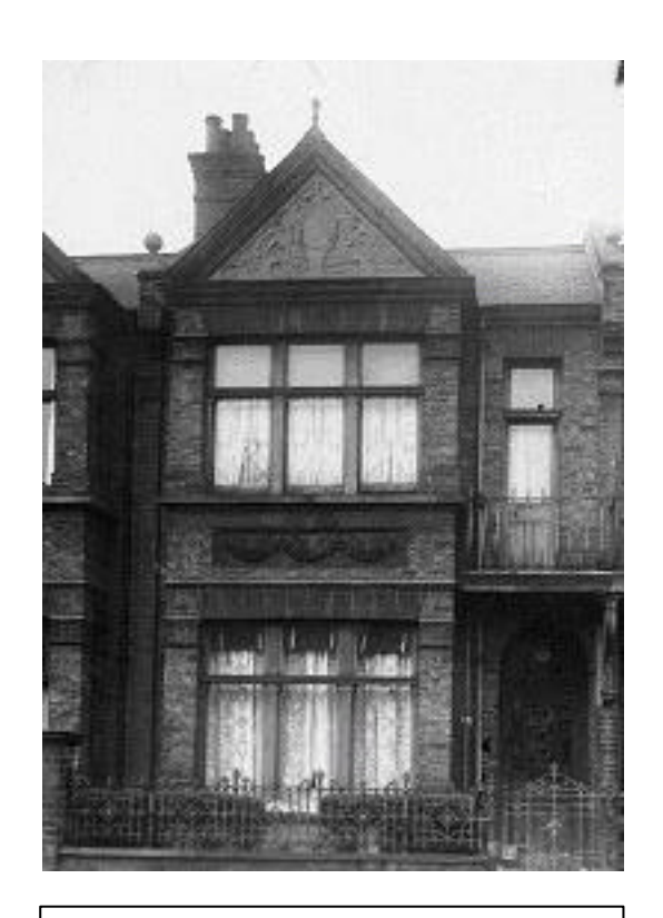
A Langler and Pinkham house in Clifford Gardens

the unenviable reputation of being a near slum. 55% of the population of Kensal New Town were in poverty in 1899. One old resident, however, a schoolgirl in 1900, fondly remembered Kensal Green as being "a proper little village" with 18 shops in Hazel Road.