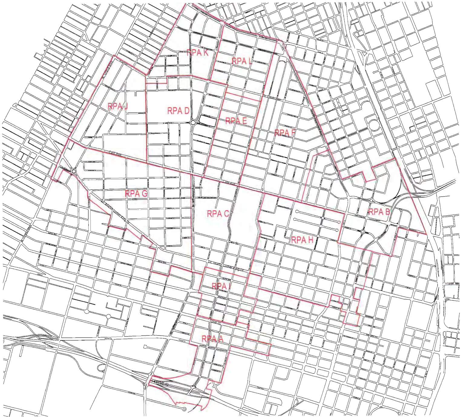
RPA BOUNDARIES ST. LOUIS NORTHSIDE 01/20/09