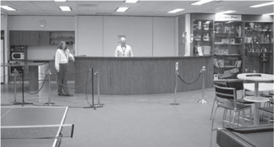
The enquiry counter from the executive area of the Northbridge branch in its new role as the bar in the amenities area of the site.

Business and service lines were organised similarly to the old branches with senior tax officers in charge and functions like audit and enforcement spread across the lines as need dictated. However, a line usually had staff located in many sites who were managed and communicated with each other using modern technologies including email, telephone and frequent flights between sites to attend meetings. 497