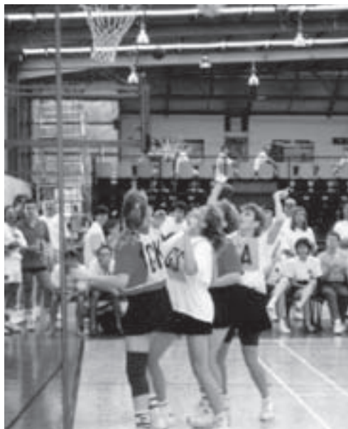
Competition during the Interstate Sporting Carnival in Perth, 1992.

The changes were welcomed by the community and in the press as 'equal to world-best practice' and 'the most important change in 20 years'. The Australian Financial Review wrote that self-assessment had been a 'catalyst for a tremendous change in culture at the ATO' and that the ATO had changed 'from people being bogged down in the office processing paper, to people getting involved in audit, getting out into the field among taxpayers, understanding what people do, why and how they are doing it.' However, not everyone agreed with the positive appraisal and outside scrutiny of the ATO continued with regular visits from and reports by the Australian National Audit Office.