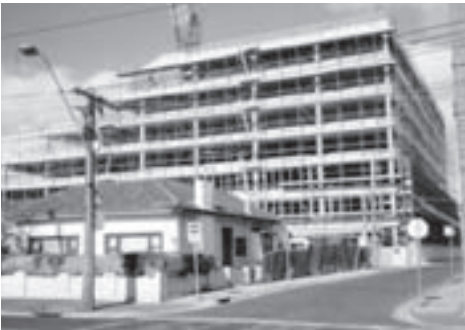
Moonee Ponds office under construction.

The problems and cost of fitting out ATO accommodation with so much new computer equipment often made it more efficient to move to new buildings, most purpose-built to meet the needs of modernisation and standards set out in the modernisation agreement. Two new ATOs were constructed in both Adelaide and Perth and staff in the existing single offices in those cities divided between them. At Parramatta the ATO moved into a new building fitted for modernisation and a new branch that was destined to be located further out from Sydney at Penrith was co-located in the Parramatta building until a suitable building was ready at Penrith. By June 1996 the ATO had 25 branch offices, 17 regional offices and National office in Canberra. 459