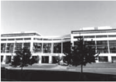
National office, 2 Constitution Avenue, Canberra.