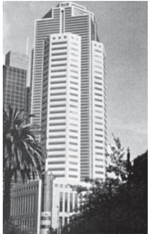
Casselden Place office.