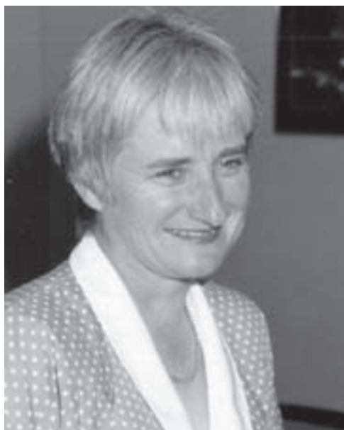
Moira Scollay, the ATO's first female Second Commissioner.

The ATO's responsibilities continued to grow into areas outside collecting revenue. The Child Support Agency had been launched as part of the ATO in June 1988 with offices in each state capital and had three new offices by 1991. It provided support for around 300,000 children by 1994. The agency's work was complex and stressful because of the charged emotions that surrounded broken relationships so some staff found the work almost unbearable while others drew strength from the value of their achievements. 464