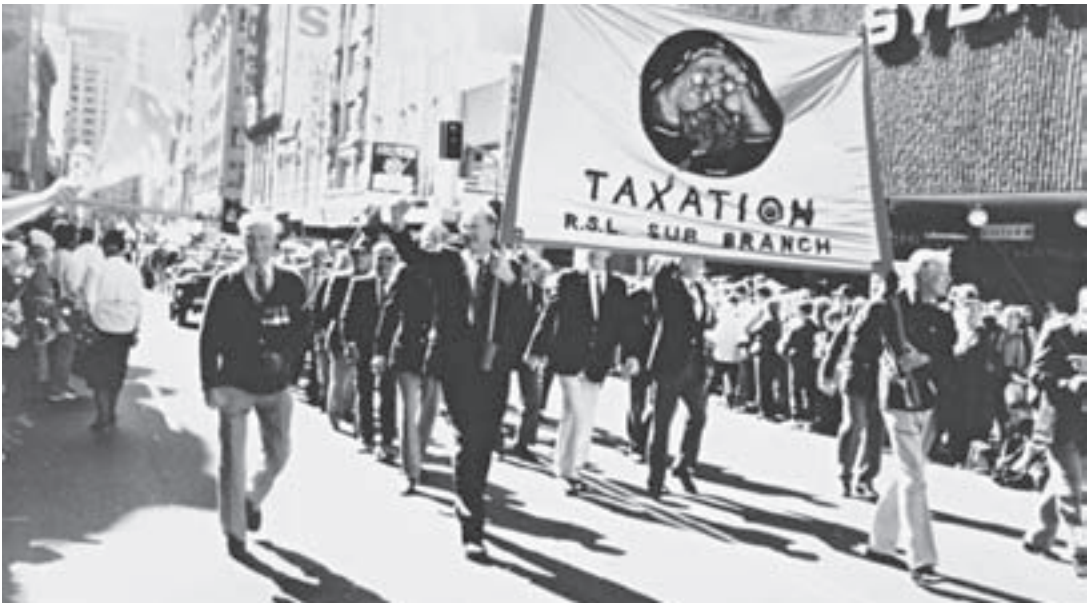
The Taxation RSL sub-branch.

The RSL sub-branch in the Sydney Branch of the ATO had existed since the 1920s but its members always marched with their service units. In 1995 when Australia celebrated 50 years since the end of World War Two, tax officers raised funds through the sale of Australia Remembers badges. With the money they bought a Taxation RSL Sub-branch banner which returned tax officers marched behind in the special parade. The banner shows two hands squeezing blood out of a stone.