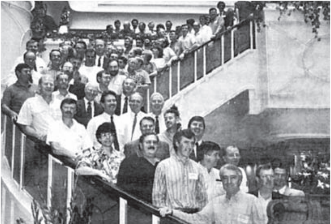
ATO leaders – members of the Senior Executive Service at a conference in 1992.

popular by the growth of the internet from around 1995, so that nearly half of all Australian adults and 40 per cent of Australian households had access to computers and were online by 2000. 485