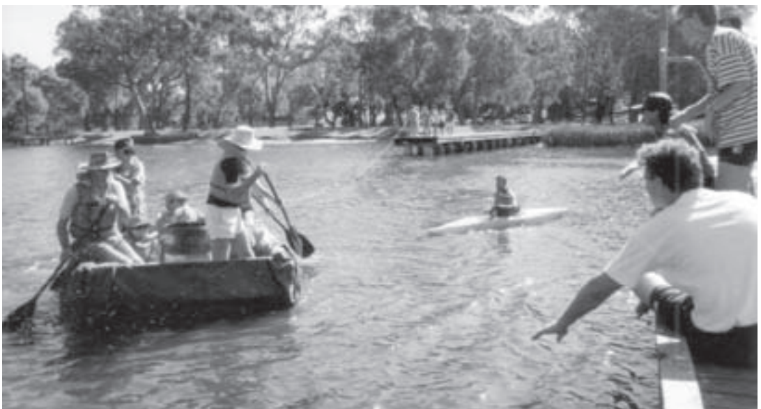
Western Australian tax officers take part in a Managing in the Nineties team-building exercise.

This change was achieved through the reorganisation of the public service, combined with new ideas about management far removed from traditional ATO structures, leading to a new, more participative working culture which was created by a program called Managing in the Nineties . It was designed to educate leaders at all levels in modern management ideas and methods to create a new ATO working environment. Staff were taken away from the office for a few days to places with the necessary facilities and atmosphere, usually established places such as the Wrest Point Casino where some of the Hobart branch courses were held or an old abandoned building where some courses were held in Sydney. The courses were run by experienced facilitators who took participants through a broad range of classes, workshops and team-building exercises to introduce them to the new ideas and techniques. Some participants thought the course was a waste of time and irrelevant but a great many, including baby boomers who were starting to reach senior levels in the ATO, felt the course gave them the tools and understanding they needed to help them reshape the ATO from the place of discipline and hierarchies they had known to a more humane organisation. 457