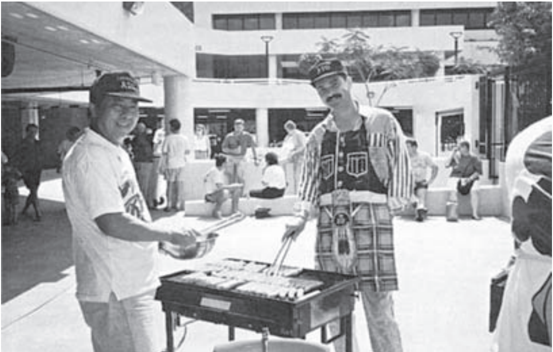
A staff barbeque was an informal part of the opening of the Chermerside office in Brisbane.

Modernisation led to improved working conditions for most tax officers. Office furniture was redesigned to replace the traditional tables and chairs in straight lines with 'workpoints' which changed how offices looked and felt. They provided space for a computer and keyboard, a telephone and other equipment and a clerical area to give tax officers new efficient working environments that they could also make more personal. In addition, the modernisation agreement specified a minimum distance between workpoints and sources of natural light so that many of the newly-designed ATO buildings such as those at Moonee Ponds, Hurstville, Hobart and Wollongong had large indoor atrium spaces. 461