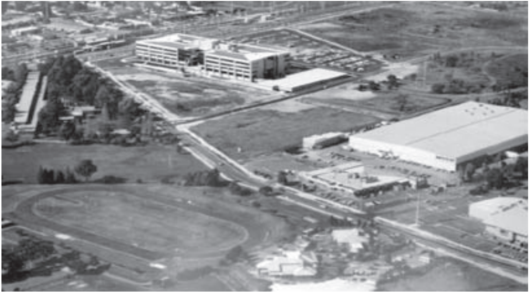
Cannington office in suburban Perth.

These differences, along with the diversity in ages and backgrounds, eroded much of the ATO's earlier social cohesion. The old 'hard-drinking and hard-working' tax officers had retired by the 1990s and taken a lot of that culture with them. The baby boomer generation entered middle age and had largely traded their partying youth for family-raising and other priorities, while many tax officers from migrant backgrounds had no experience of old Australian social customs that had been commonplace in the old ATO. The school leavers who had come in through the Public Service Board had formed new friendships in the ATO because that had been their introduction to the adult world, but recruits like graduates already had an established circle of friends, and a HECS debt to curb their spending. 472