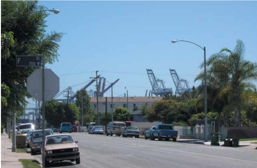
Cranes at the Port of Los Angeles are a looming reminder of how highly industrialized and noisy port operations often encroach on neighboring communities.

the harbor. 36 One of the most notable examples of water quality degradation relates to petroleum coke (a cancer-causing black powdery byproduct of petroleum refining) and coal transport facilities at the Port of Los Angeles. 37 For years, piles of the greasy coke, hundreds of feet high, stood completely uncovered immediately adjacent to San Pedro Bay. 38 In one area, 10 feet of coke and copper concentrates were found covering the bay's bottom, extending approximately 200 feet from shore. These piles have since been enclosed, pursuant to a rule adopted by the South Coast Air Quality Management District, and 300,000 cubic yards of sediment are proposed for removal. 39,40,41