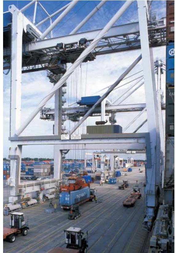
Specialized yard equipment that shuttle containers around at ports are at least 15 times more polluting than trucks driven on the road.

The port asserts that it meets government requirements for various stormwater treatment and control methods. Notably, it offers pollution prevention training to terminal operators and uses deep injection wells and "baffle boxes" to collect and treat stormwater runoff from paved areas. 241 The port also has implemented oil spill prevention and control plans that include monthly meetings with the Coast Guard and other stakeholders.