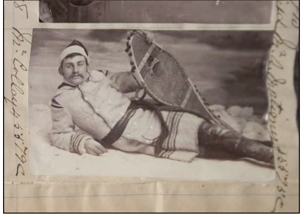
Figure 20. (Above Left) Portrait with sheepskin snow, salt snow, and painted background, 1883-84.

sprinkled on the subject (Fig. 20). This was an often portrayed scene throughout the life of the Topley Studio.