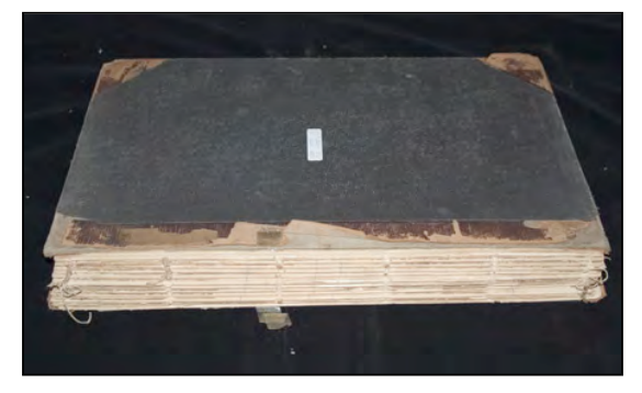
Figure 16. Topley Index Album, 1875 (good condition).

will be disbound and the pages stored separately ( Fig. 15). Tattered could be rebound but it would require an inordinate number of treatment hours to repair the pages enough to make rebinding possible, and even then might be too weak ( Fig. 14). So again, it must be disbound and the pages stored separately. But there were many others,