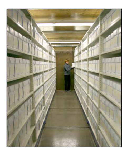
Figure 8. Topley glass plate negative collection at the Library and Archives.

The albums themselves vary in construction and the type of paper used. They were manufactured commercially by various Canadian stationers usually in Montreal or Ottawa. They are basically customized ledger books, rather than typical photograph albums. They are sewn, often with guards to allow for the thickness of the photographs, and are typically ½ leather bindings with sheep skin spine and corners. The pages vary from quite thin and flexible to thick and very brittle, and are ruled in blue or red ink for cabinet or CDV size prints. The negative number and a brief description is written in iron gall ink below each photograph.