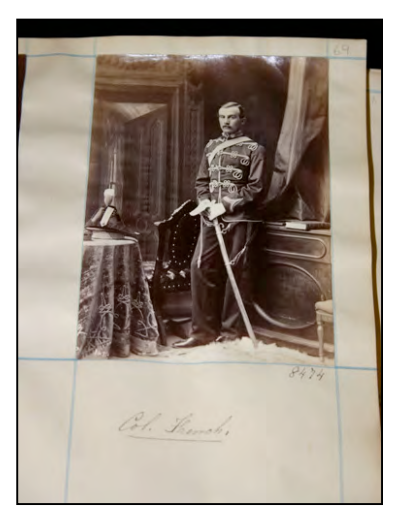
Figure 18. (Above) Cabinet card portrait with painted. Figure 19. (Below) Painted background with bottom and right side visible, 1905.

Another technique used by Topley from the start was the snow scene. The painted background is still used, but the snow scene imagery is further embellished with sheepskin on the floor and course salt