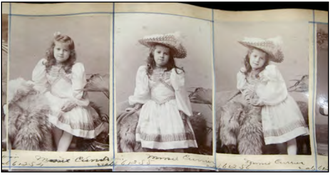
Figure 26. (Above) Curly bangs and hats with ribbons, 1886. Figure 27. (Bottom) Girl with large sleeves, 1891.

But with all the changing fashions, one thing remained constant, and has even to the present day—retouching. Many of the glass plate negatives have been retouched to remove what were apparently considered facial blemishes. Many of the early photographic processes magnify even the slightest freckle or facial blemish, due to their lack of sensitivity beyond the blue part of the spectrum (reddish skin or spots appear very dark). It follows that the facial features of many people in these old photographs are often exaggerated, such as the unretouched portrait of Mr. Wickware (Fig.