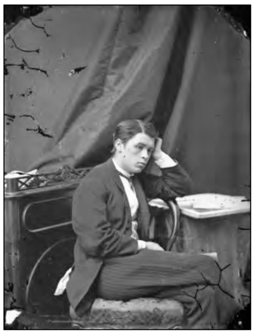
Figure 1. William James Topley, 1874

appears to be towards more conservative treatments. Discussions about these treatments have often focused on the dilemma of treating a single object—a book, that has many components—binding, pages, handwriting, and of course photographs. The dilemmas involved in the treatment of composite objects are as old as conservation, and the discussions of the past two decades, have, not surprisingly, not provided any definitive answers for the treatment of photograph albums, but have provided a resource for the consideration of current treatments. I will be presenting today the details of my own encounter with these issues, my assistance in the treatment of a single album in the Topley Collection of the Library and Archives Canada, and the conservation survey of the 66 albums which make up the