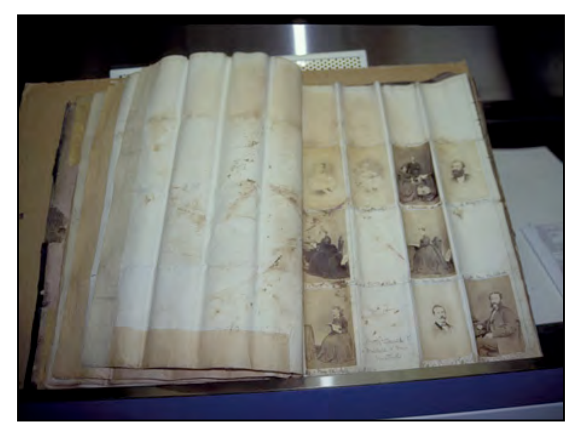
Figure 10. (Left) Cockled pages of the first Topley album. Figure 11. (Below) Page from first album after flattening.

The next challenge was the reattachment of the loose albumen prints. Because of their often poor and fragile condition, these were lined with japanese tissue and wheat starch paste, trimmed flush and then.... Well, our initial tests showed that lining with paste was going to cause considerable recurling of the pages, as we were hoping to do this without rehumidifying all of the pages. Klucel G in ethanol was attempted, but as expected was not strong enough. So, I tried a mixture of 5% Klucel G in ethanol, 10% methyl cellulose, and thick Zin Shofu, in proportions of 12:1:1. This combination was chosen with the idea that we wanted to minimize paper expansion, and yet have some water and paste content to swell the