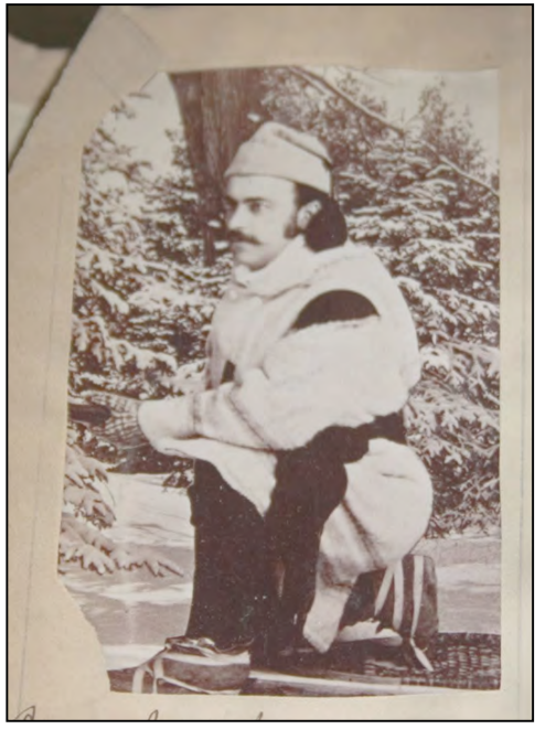
Figure 22. (Right) Cabinet card composite print, 1875.