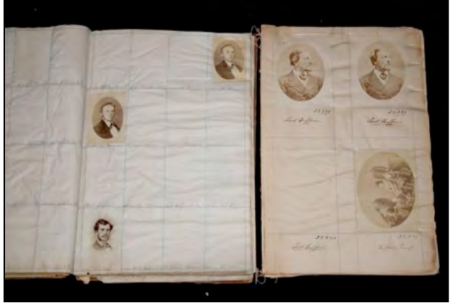
Figure 4. (Left) Topley Index Albums, 1920s.