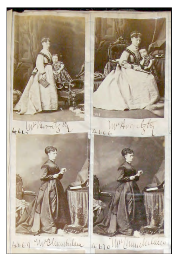
Figure 25. Women's dresses, 1869.

though off-shoulder dresses for boys were happily on the way out. The wing collar was a common style for men. The hair was also shorter than in previous decades and typically brushed back and away from the ears. Beards tended to be shorter and there were more moustaches.