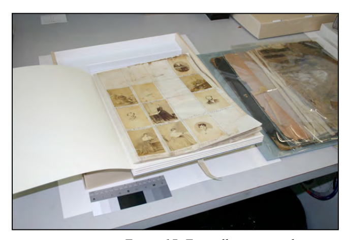
Figure 17. First album in new housing.

In the final tally, nearly half of the albums will be disbound. Of course, this will be not only well documented, but all original materials will be preserved, and the original context will still be respected by housing the folios together and in the proper order (as shown here in the case of the first album of the Index) ( Fig. 17 ). So that if it is desired, the original binding could be reconstructed at any time.