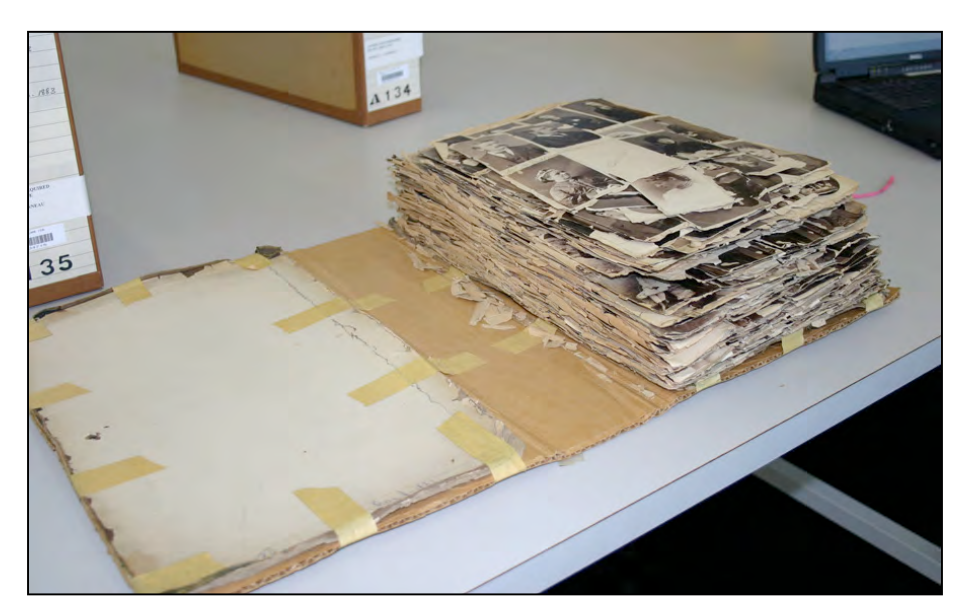
Figure 14. Topley Index Album, 1881-82 (tattered).

thin, and quite weak. The pages of the next album need few repairs, but are so brittle that they have already cracked at the gutter, and would not withstand rebinding (Fig. 15). And some are in good enough condition to withstand rebinding (Fig. 16 ).