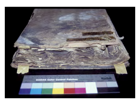
Figure 9. First album in Topley Index before treatment.

Upon my arrival at the Archives, my first task was to assist book conservator Lynn Curry with the treatment of the first album in the Topley Index ( Fig. 9 ). The treatment had begun months before, and I was to assist with the flattening of the pages, and the reattachment of 159 loose albumen prints that had been removed for the treatment of badly mold damaged and soot stained pages, and 9 other prints that had been found loose when the album arrived for treatment.