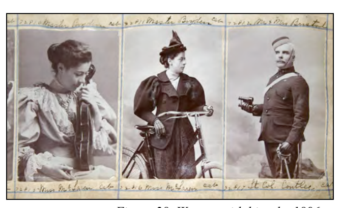
Figure 28. Woman with bicycle, 1896.

29). The telltale signs of retouching became very obvious after viewing several albums. It is typically seen as a kind of stippling, seen here on the face of Mr. Wickware (Fig. 30), created by pencil. Retouching the retouching accomplished on the negative by first applying a retouching varnish which gives the surface enough tooth to accept the pencil markings, and then applying the pencil, often with a stippling action as is seen in many of the Topley portraits.