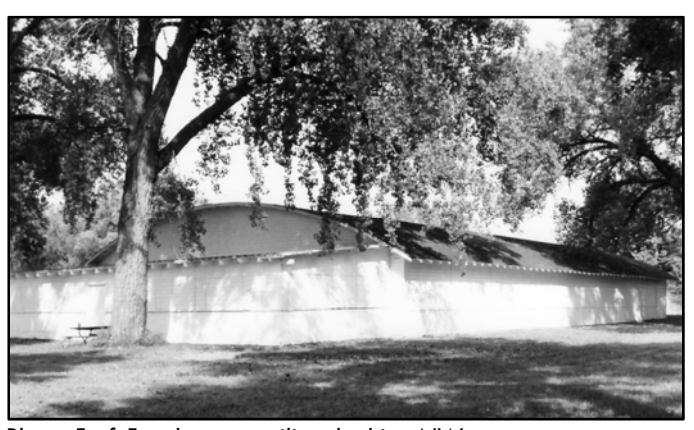
Photo 5 of 5 – dance pavilion, looking NW Photo by Carol Ahlgren, 1998, NSHS (9808/3:10)