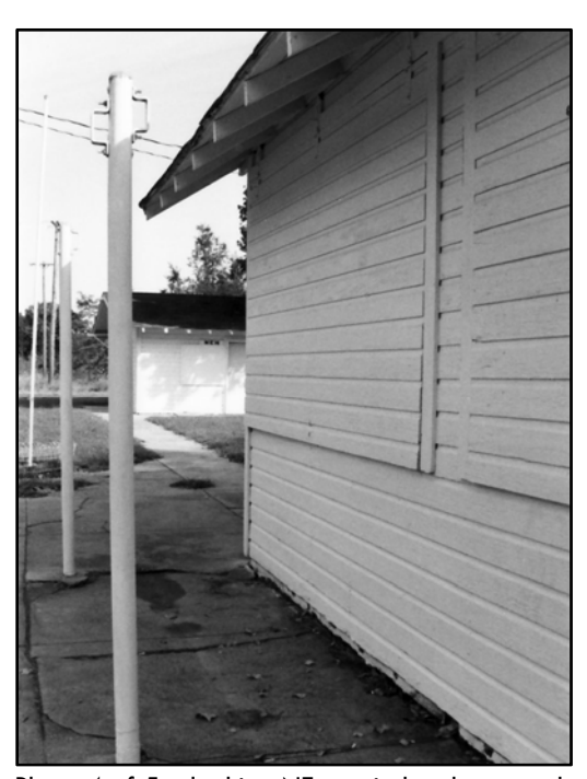
Photo 4 of 5 – looking NE at window brace pole Photo by Carol Ahlgren, 1998, NSHS (9808/3:6)