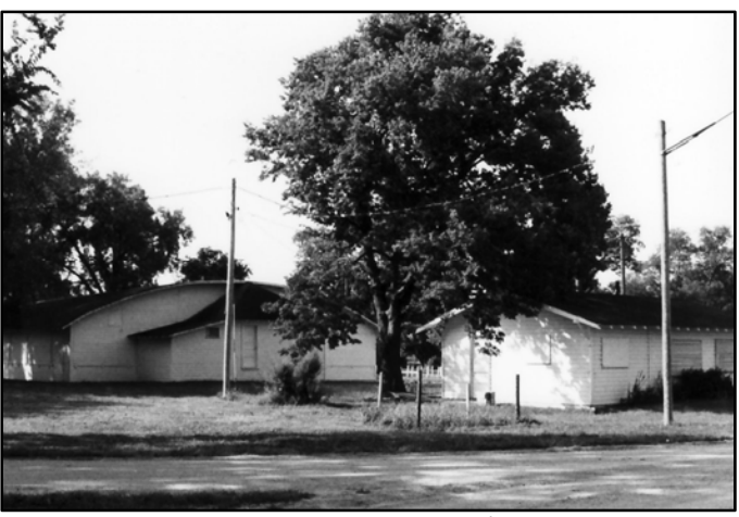
Photo 1 of 5 – dance pavilion & restroom/concession bldg, looking SW Photo by Carol Ahlgren, 1998, NSHS (9808/3:4)