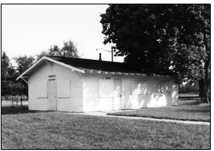
Photo 2 of 5 – restroom/concession bldg, looking NE Photo by Carol Ahlgren, 1998, NSHS (9808/3:1)