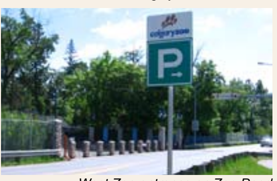
West Zoo entrance on Zoo Road

Start at the Eau Claire Trans Canada Trail Pavilion. Travel east along the Bow River pathway (with the Bow River on your left) and walk past two bridges. When you come to the third one – the Old Langevin Bridge – it's time to cross the river. Once across, continue traveling east along the pathway. You will pass by one more bridge and walk under yet another one. Shortly after you pass the Bridgeland/Memorial CTrain Station it will be time to cross the river once again at the Baines Bridge. Continue south on Zoo Road N.E. until you reach the west entrance of the Calgary Zoo.